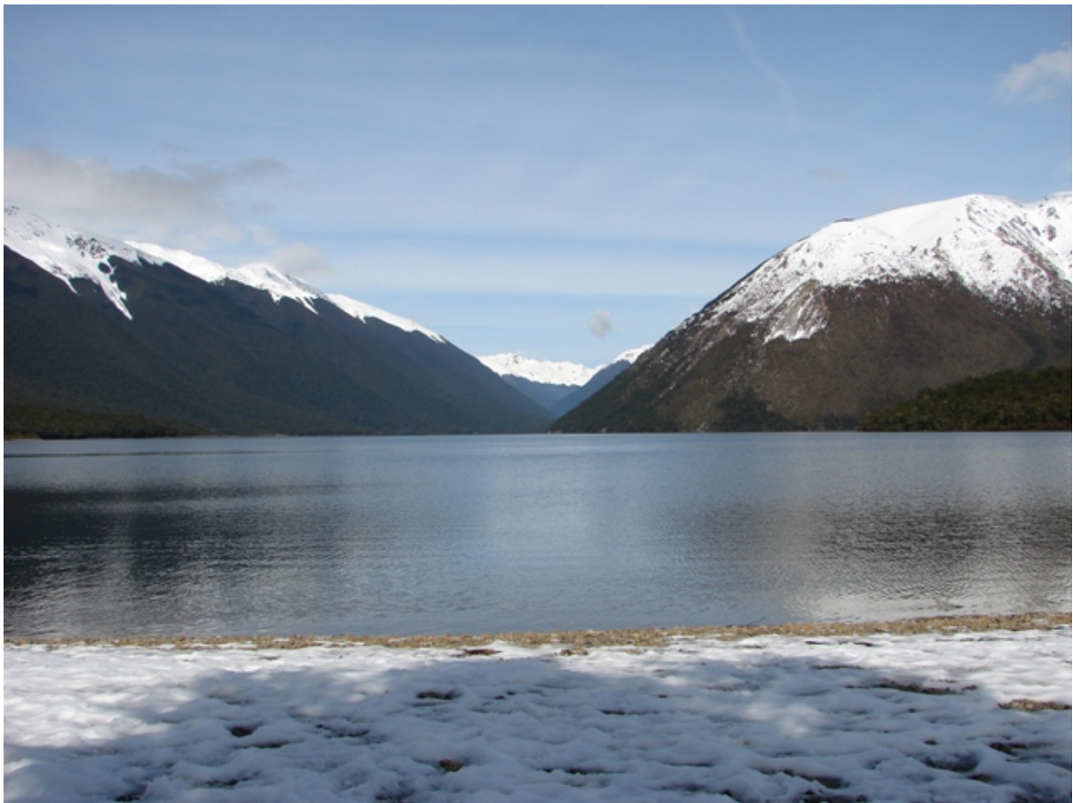
Lake Rotoiti – Nelson Lakes