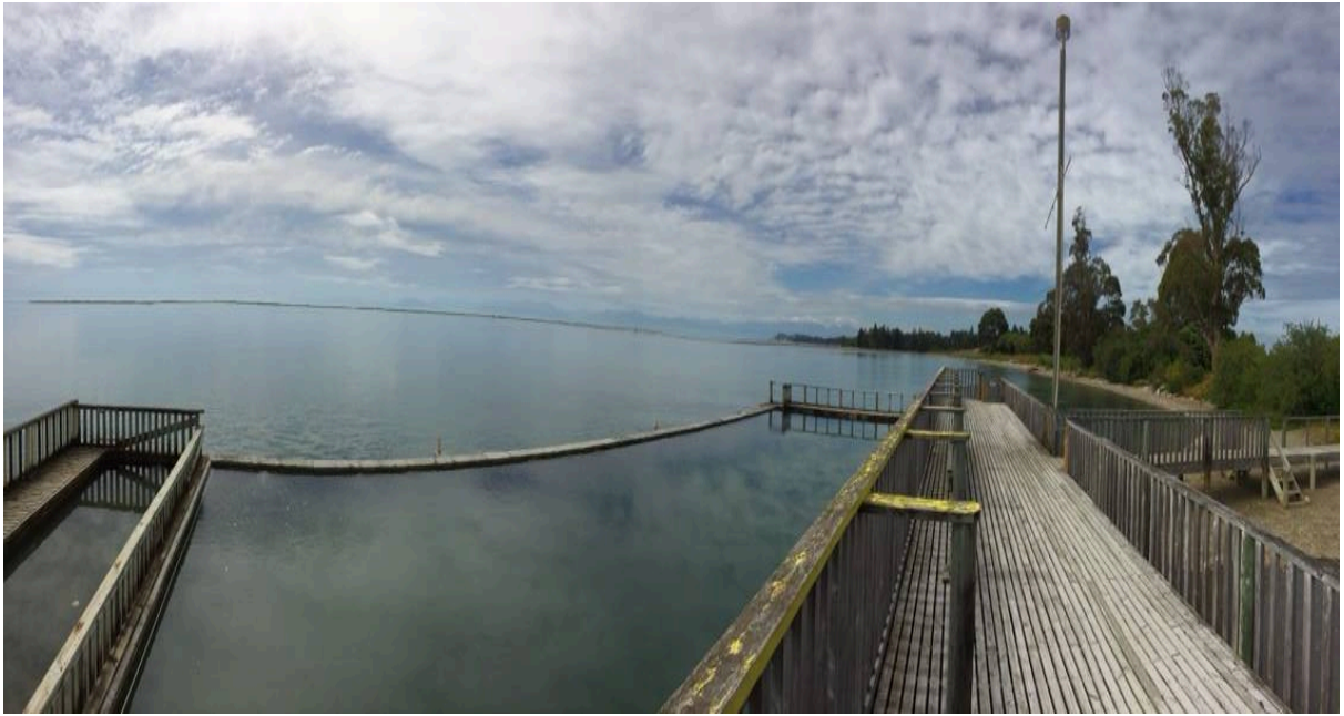
Saltwater Baths, Motueka