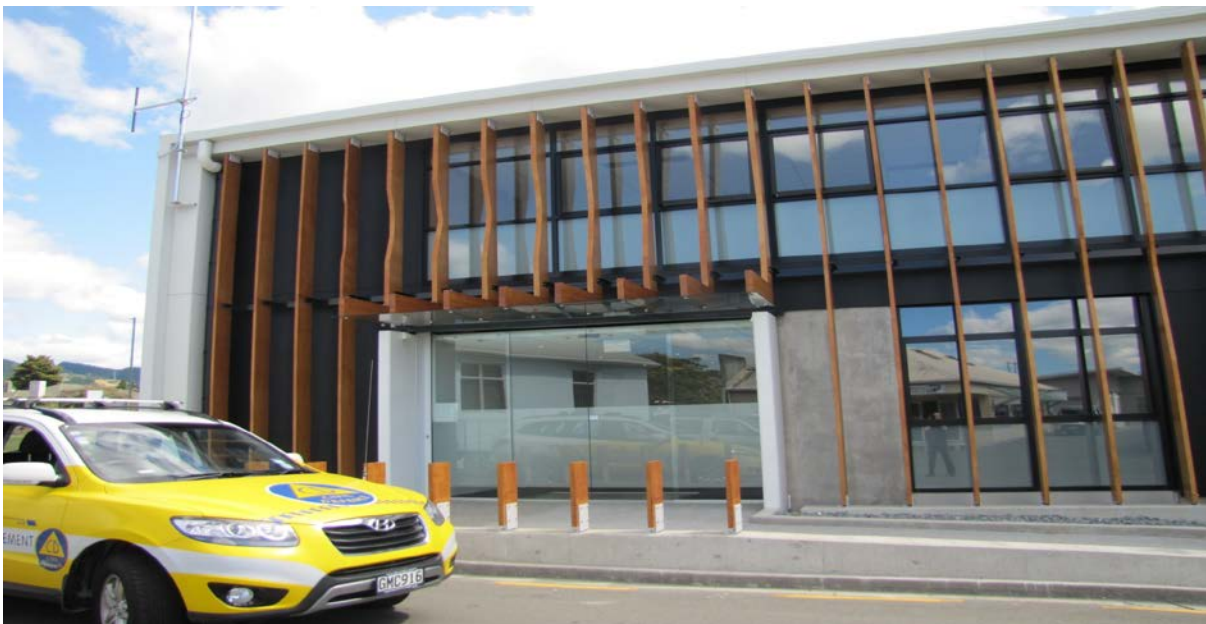
New Nelson Tasman Group Emergency Operations Centre