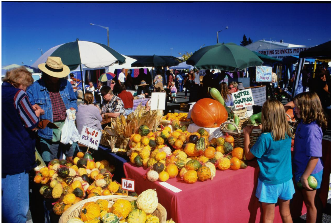
Motueka Sunday Market