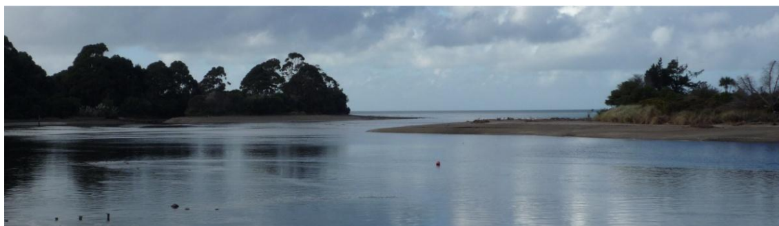
Milnethorpe, Golden Bay