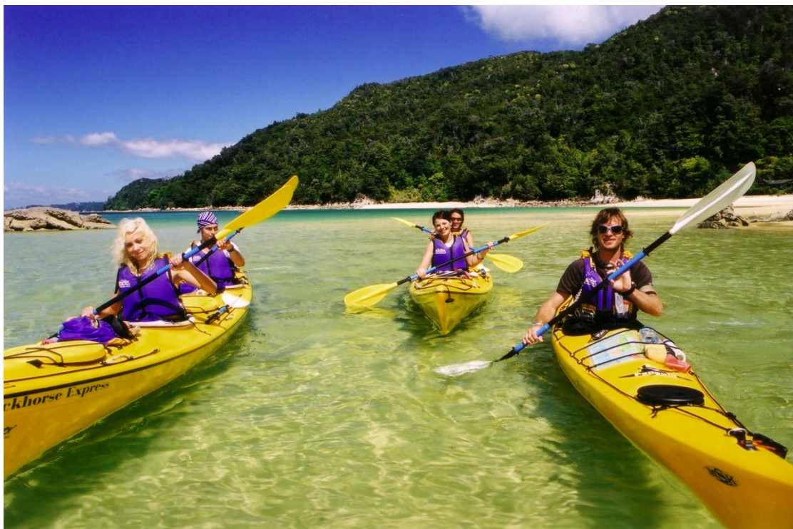
Kayaking Abel Tasman