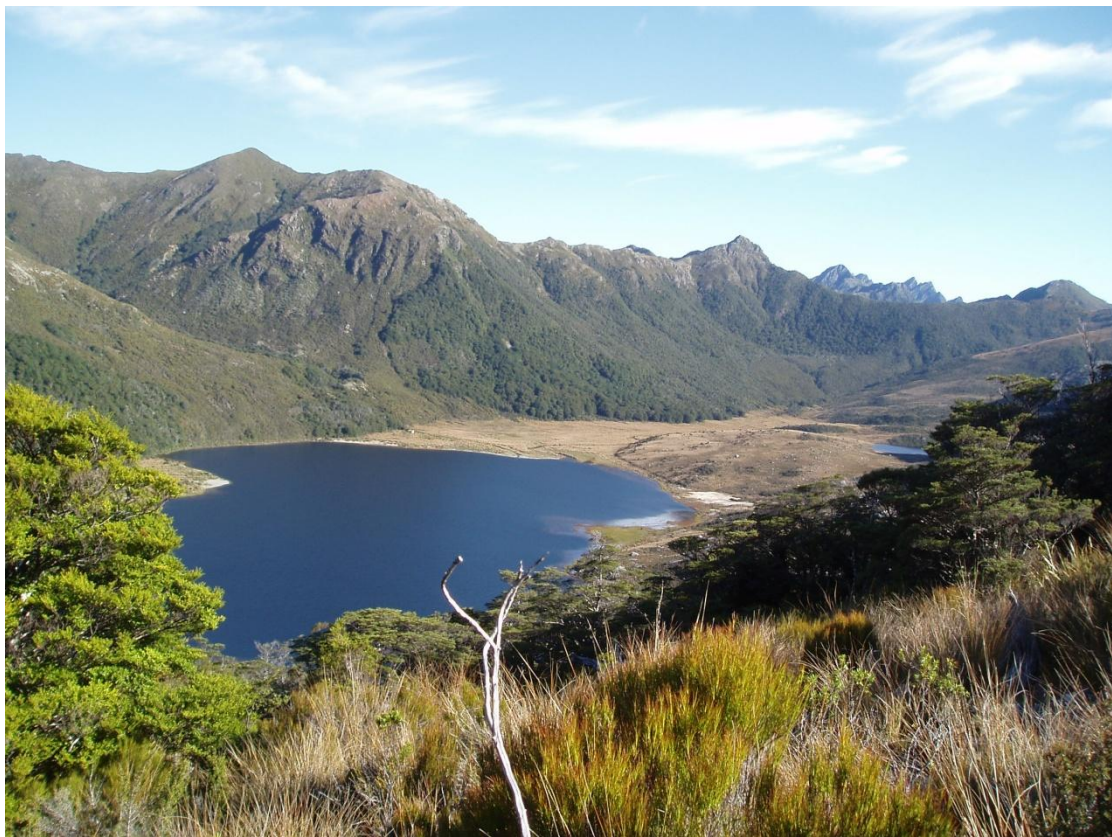
Dragons Teeth - Matiri