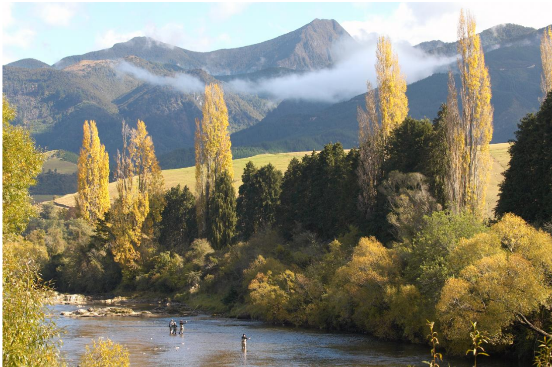
Fishing - Motueka River

For further details on the key changes, issues and uncertainties please refer to pages 21 – 30 of the Draft Annual Plan 2011/2012.