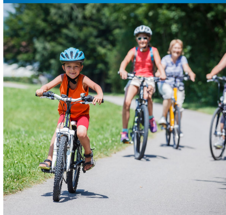
10645 HoHouse Communications