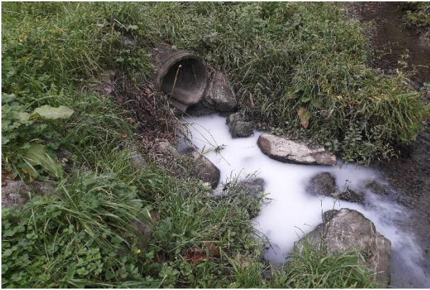
Jimmy Lee Creek pollution caused by the water blasting of old paint off a roof.

It is illegal and harmful to discharge water blasting waste into the stormwater system as it can negatively affect the quality of our environment. It is your responsibility to prevent discharges from your water-blasting activities into street drains. Make sure you put appropriate controls in place before you start.