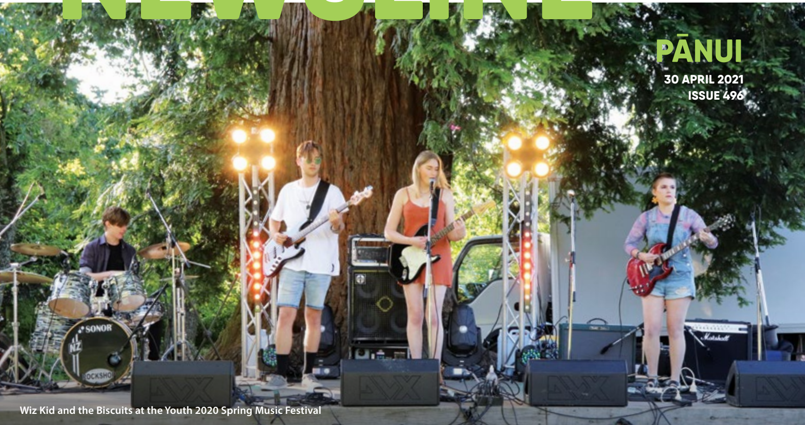
Wiz Kid and the Biscuits at the Youth 2020 Spring Music Festival