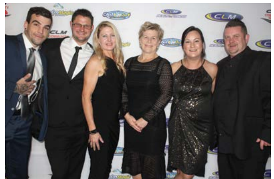
The Richmond Aquatic Centre team.