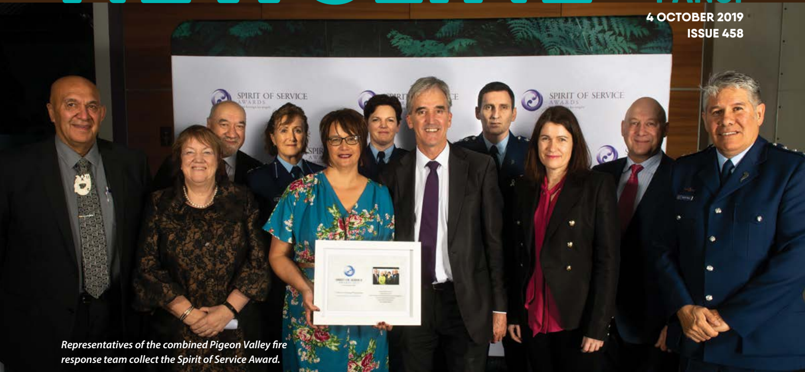
Representatives of the combined Pigeon Valley fire response team collect the Spirit of Service Award.