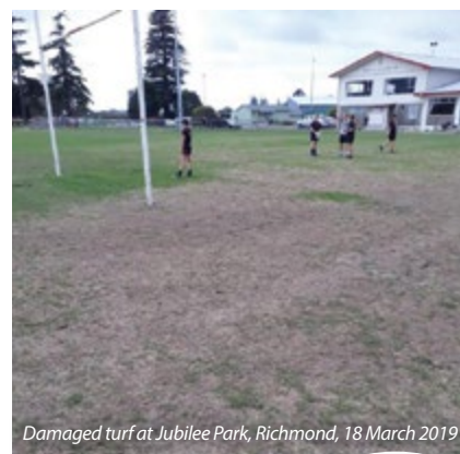
Damaged turf at Jubilee Park, Richmond, 18 March 2019

Replacement plantings will take place in some areas over autumn and winter.