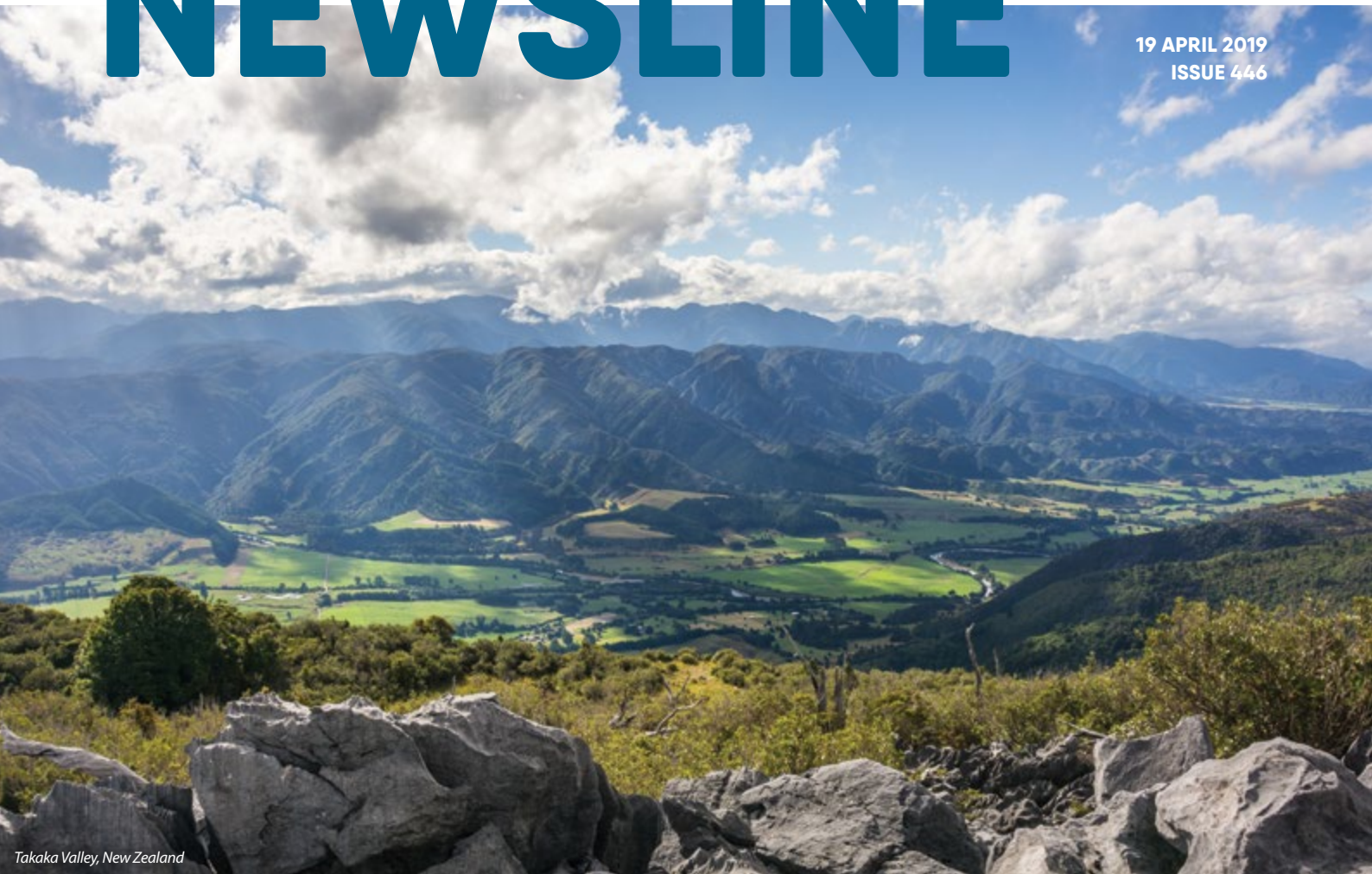
Takaka Valley, New Zealand