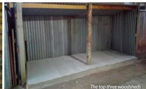
The top three woodsheds