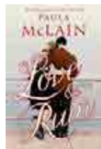
Love & Ruin by Paula McLain