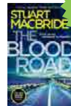
The Blood Road by Stuart Macbride