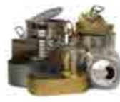
TIN AND ALUMINIUM

Exported for recycling. Now being sent to alternative offshore processing facilities to be turned into corrugated cardboard and recycled paper. Value has dropped by 90%.