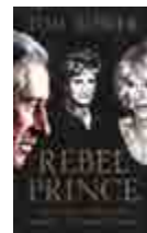
Rebel Prince by Tom Bower