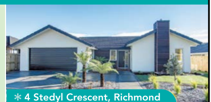
* 4 Stedyl Crescent, Richmond

* SHOWHOMES 2 & 4 Stedyl Crescent Richmond OPEN Monday to Friday 11.00am–4.00pm Saturday & Sunday 1.00pm–4.00pm