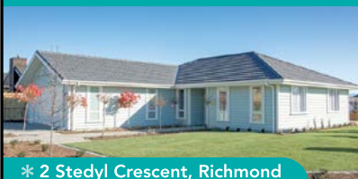
* 2 Stedyl Crescent, Richmond