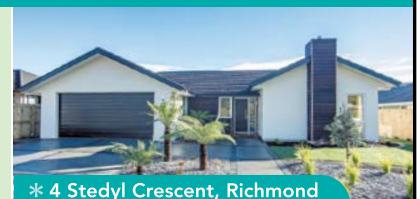
* 4 Stedyl Crescent, Richmond

* SHOWHOMES 2 & 4 Stedyl Crescent Richmond OPEN Monday to Friday 11.00am–4.00pm Saturday & Sunday 1.00pm–4.00pm