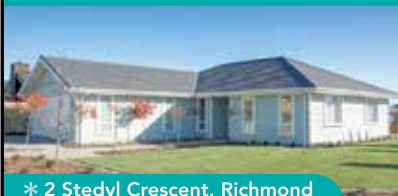
* 2 Stedyl Crescent, Richmond