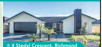
* 4 Stedyl Crescent, Richmond

2 & 4 Stedyl Crescent Richmond OPEN Monday to Friday 11.00am–4.00pm Saturday & Sunday 1.00pm–4.00pm