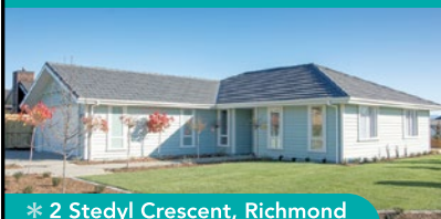
* 2 Stedyl Crescent, Richmond