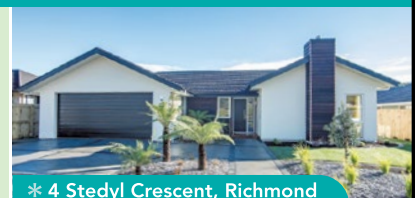
* 4 Stedyl Crescent, Richmond

* SHOWHOMES 2 & 4 Stedyl Crescent Richmond OPEN Monday to Friday 11.00am–4.00pm Saturday & Sunday 1.00pm–4.00pm