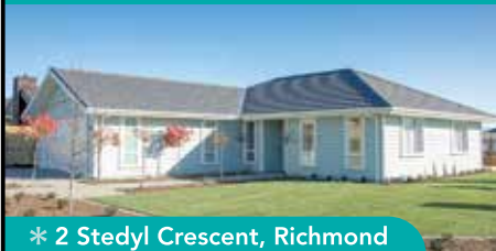
* 2 Stedyl Crescent, Richmond