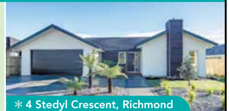
* 4 Stedyl Crescent, Richmond

2 & 4 Stedyl Crescent Richmond OPEN Monday to Friday 11.00am–4.00pm Saturday & Sunday 1.00pm–4.00pm