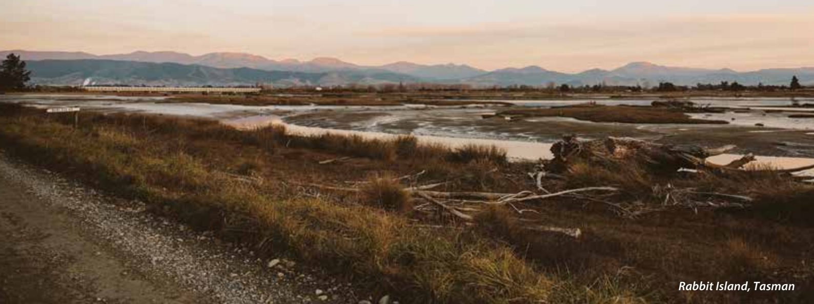
Rabbit Island, Tasman

Keeping you informed about news and events in Tasman District