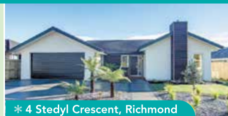
* 4 Stedyl Crescent, Richmond

2 & 4 Stedyl Crescent Richmond OPEN Monday to Friday 11.00am–4.00pm Saturday & Sunday 1.00pm–4.00pm