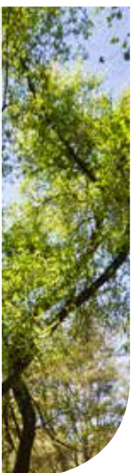
9498 Hothouse Communications

FREEPHONE 0800 725 326 www.nmwaste.co.nz • sales@nmwaste.co.nz