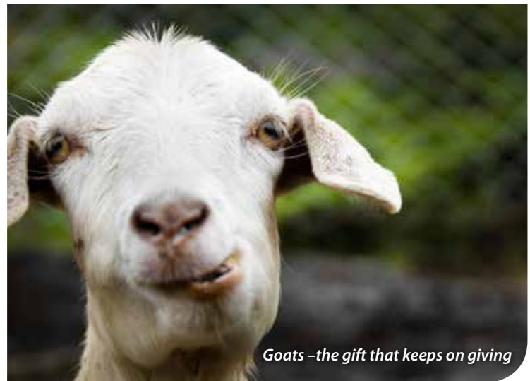
Goats – the gift that keeps on giving

"It's fabulous that once again Kiwis in some of our most beautiful rural areas are giving a hand up to rural communities in developing countries and helping them to build a better future for their families."