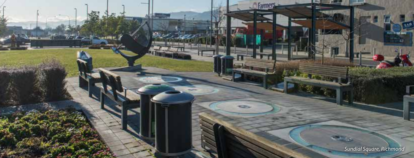
Sundial Square, Richmond

Keeping you informed about news and events in Tasman District