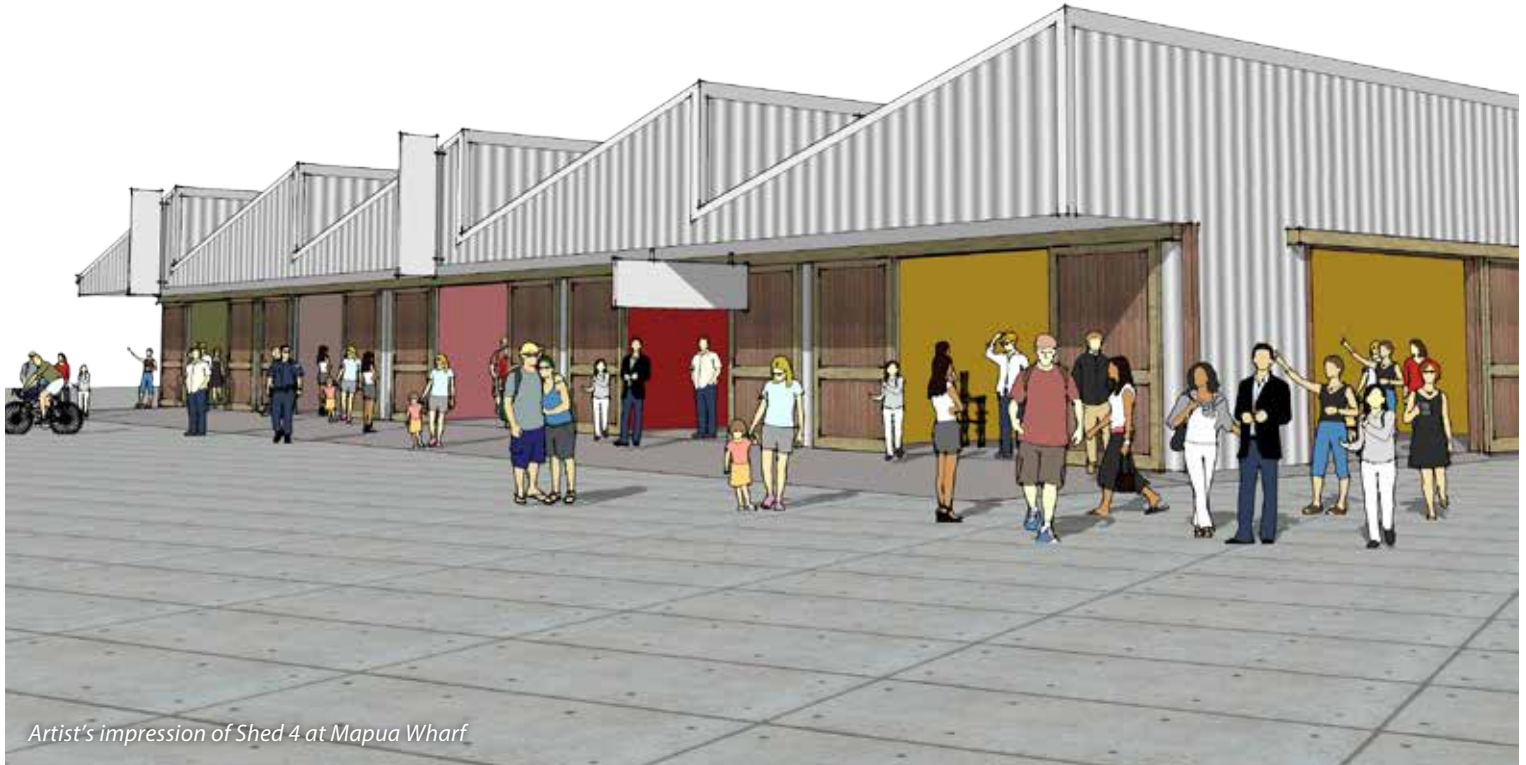
Artist's impression of Shed 4 at Mapua Wharf

For those who like walking the block from Higgs Road down to the intersection of Aranui Road and Mapua Drive, the new footpath currently being built will be a welcome addition.