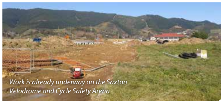
Work is already underway on the Saxton Velodrome and Cycle Safety Arena

"The feedback we're getting from funders is that they see it as a worthwhile community project. We're having conversations with other funding providers and we're very confident we will get across the line. However we still need to raise considerable funds so we're very open to talking to potential donors and anyone who can provide in-kind support during the build process."