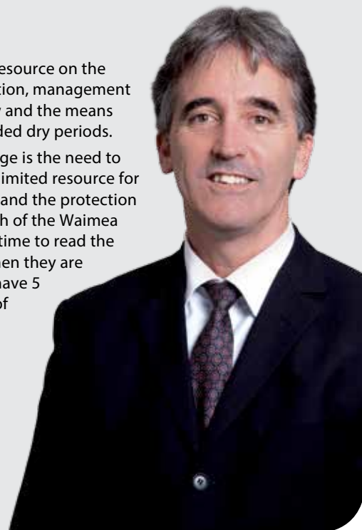
Mayor Richard Kempthorne

Driving this plan change is the need to provide water from a limited resource for all users on the Plains and the protection of the long term health of the Waimea River. Please take the time to read the proposed changes when they are released. People will have 5 weeks from the time of release to submit on the proposed Water Management Plan.