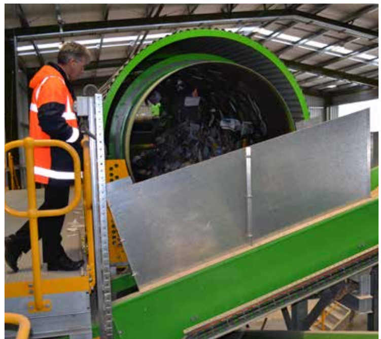
Mayor Kempthorne viewing the new centre

This is the fifth materials recovery facility that Smart Environmental has opened in New Zealand.