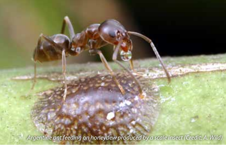
Argentine ant feeding on honeydew produced by a scale insect