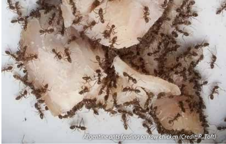
Argentine ants feeding on raw chicken