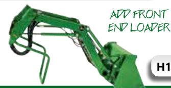
H120 NSL Loader

John Deere 54" Deck (incl Hydraulic Lift) w/Manual Connect