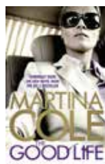
The good life by Martina Cole