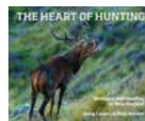
The heart of hunting by Greig Caigou