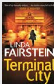
Terminal city by Linda Fairstein