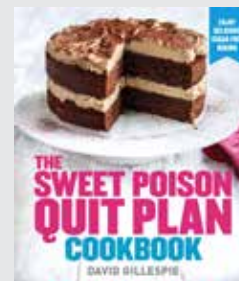
The sweet poison quit plan cookbook by David Gillespie

Check our website out for yourself at www.tasmanlibraries.govt.nz