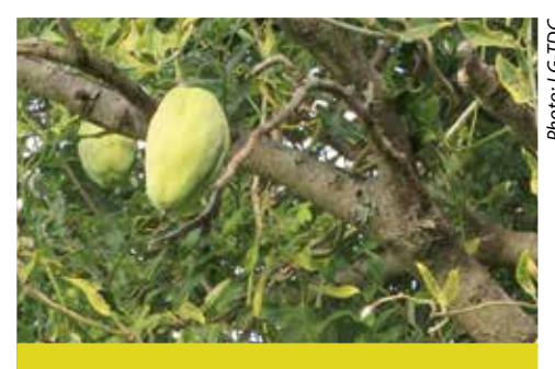
Mothplant (Araujia hortorum)

Those interested in finding out more about the Accord can download the information from the Ministry for Primary Industries website at www.biosecurity.govt.nz/NPPA