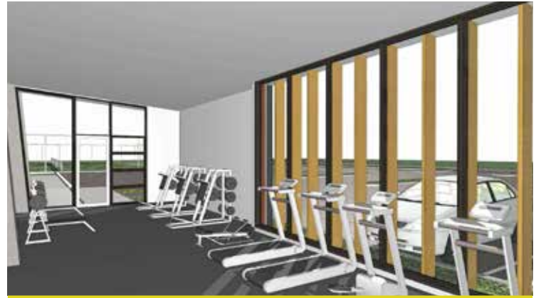
Above and below: Internal and external representations of the design for the new fitness centre.

The fitness centre, funded through financial contributions from Canterbury Community Trust, Sarau Trust, Pub Charity and IMB Construction and a huge local fundraising effort, is to be housed in an 18m x 5.5m extension on the external wall of the current sports hall. Designed by the original architects of the facility, the extension will be in keeping with the present design, flow and colour scheme.