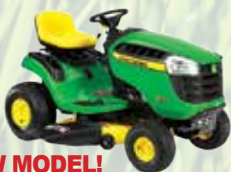
JOHN DEERE D105

NEW MODEL! 17.5hp, CVT transmission, 42" deck.