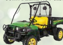
JOHN DEERE XUV 825i

NEW MODEL! 4WD, 24.2hp 3cyl Yanmar Diesel, Hydrostatic transmission.