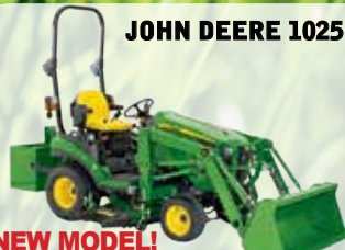
JOHN DEERE 1025R

NEW MODEL! 4WD, 24.2hp 3cyl Yanmar Diesel, Hydrostatic transmission.