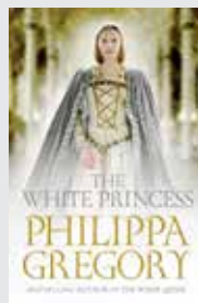
The White Princess by Philippa Gregory