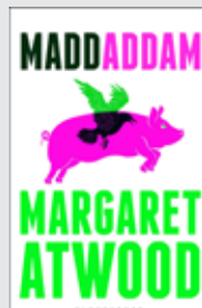
Maddaddam by Margaret Atwood