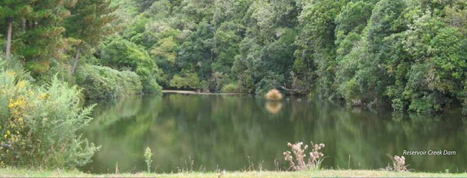
Reservoir Creek Dam

Keeping you informed about news and events in Tasman District