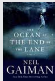
The Ocean at the End of the Lane by Neil Gaiman

Check our new site out for yourself at www.tasmanlibraries.govt.nz