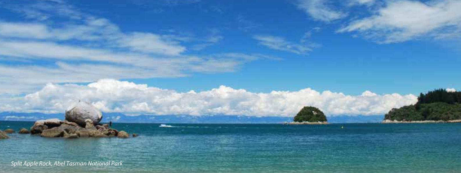
Split Apple Rock, Abel Tasman National Park

Keeping you informed about news and events in Tasman District