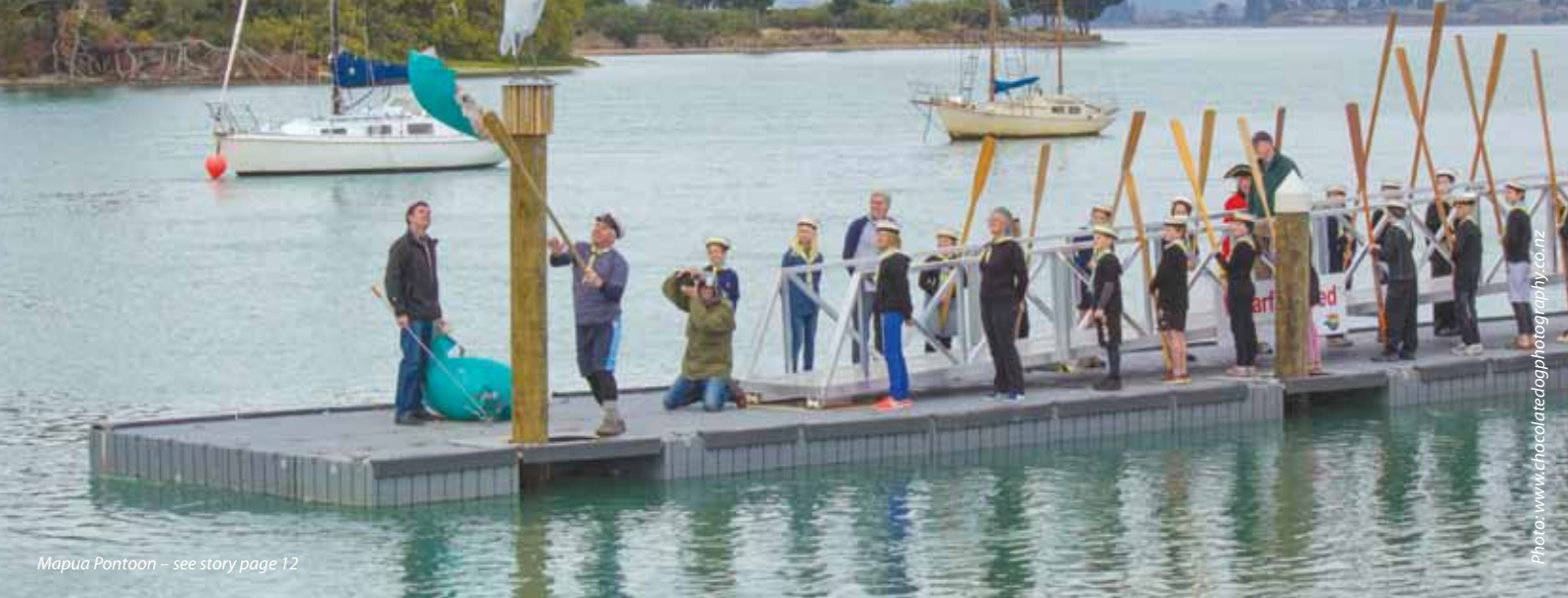
Mapua Pontoon – see story page 12

Keeping you informed about news and events in Tasman District