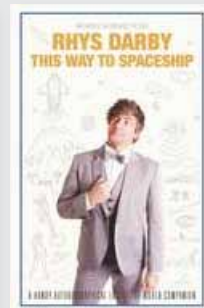
This Way To Spaceship by Rhys Darby

Read more online - go to www.taslib.govt.nz