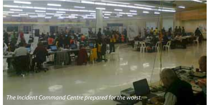
The Incident Command Centre prepared for the worst.