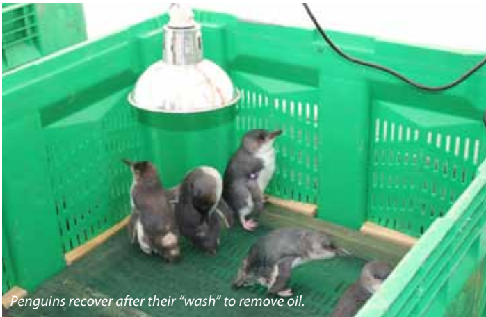
Penguins recover after their “wash” to remove oil.

“Very interesting... but certainly high-pressure,” he says. “In a way, enjoyable as the adrenalin kicks in. Everybody just had so many things to do. It would be a rare two minutes that someone didn’t tap you on the shoulder with a question or request.”