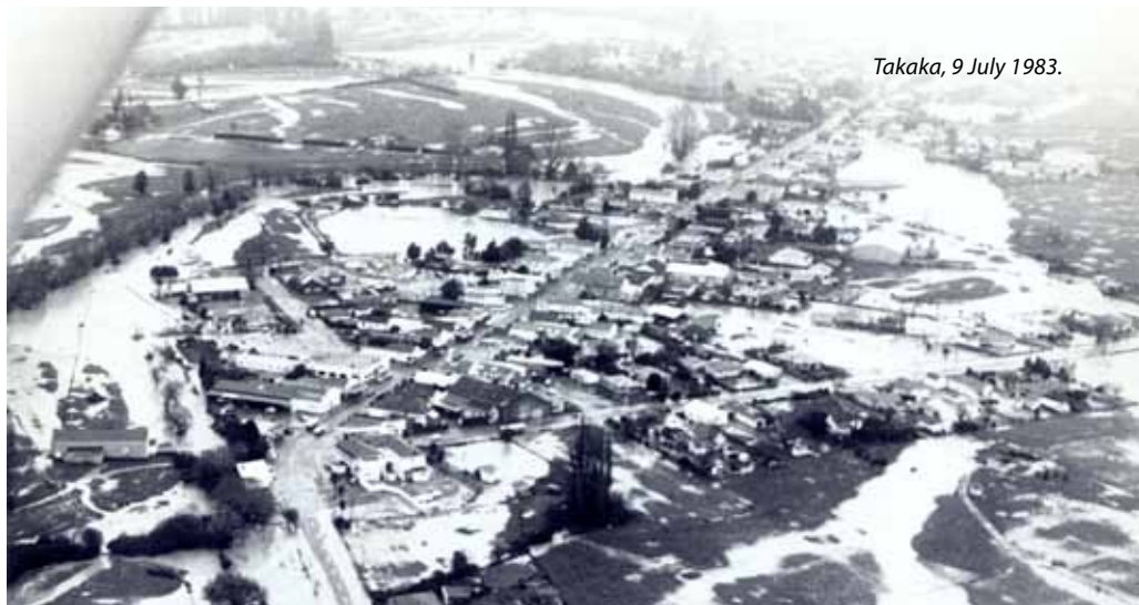
Takaka, 9 July 1983.

The flood modelling was made possible through surveys using LiDAR, aircraft-mounted equipment that bounces a laser beam off the ground below to produce precise elevation figures.