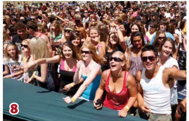
1 and 2 – Titanic Cardboard Boat Race at Tata Beach on 17 January 2010 (photos: Golden Bay Weekly). 3 and 4 – Golden Bay A&P show on 16 January 2010 (photo: GB Weekly). 5 – Looking for a bargain at WHK the Richmond Market Day on 30 December 2009 (photo: Nelson Mail). 6 – Sand sculpting at Pohara Beach on 10 January 2010 (photo: GB Weekly). 7 – Family fancy dress fun at the Tapawera A&P Show on 23 January 2010. 8 – The Summer Six concert on 9 January drew thousands of Tasman music fans to Saxton Field. (Photo: Nelson Mail)