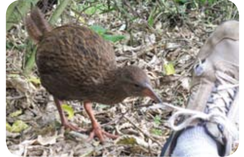
A weka gets cheeky in Wills Gully.

Dog owners must remember that it is extremely important to leash their dogs when in the presence of protected wildlife and birds, either on beaches or in the countryside.