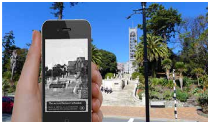
The Cathedral steps then and now – an example of how Project heART will bring the region's history to life

A launch event is planned for 14 February 2014 and the app will be freely available for download from the Apple App