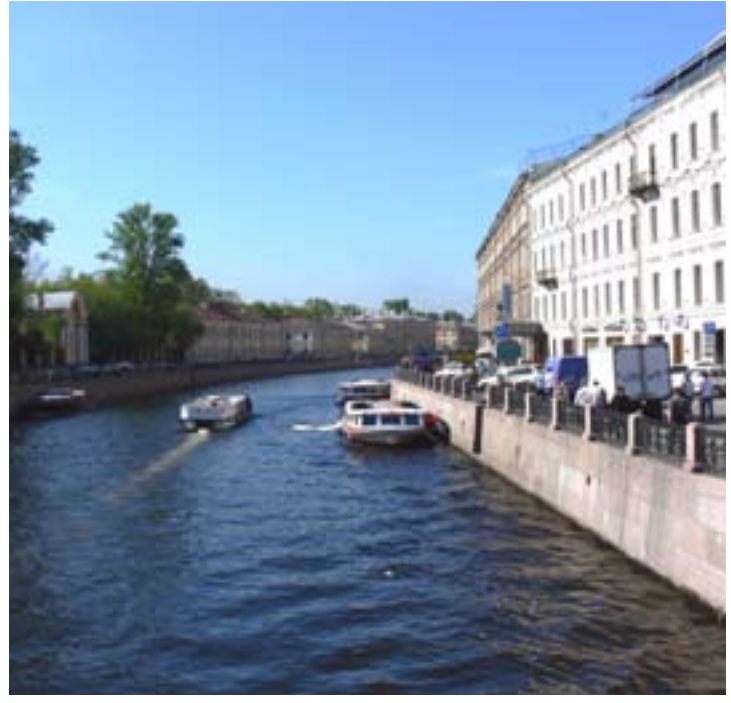
The Moskva River.

Founded in 1661, Irkustk was the main Russian fort behind the Ural mountains from which the Russians hoped to colonise Siberia. From this time, Siberia was used as a penal colony and a place of exile for political