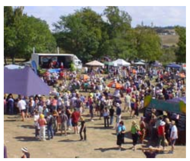
Crowds enjoying a day out at Taste Tasman 2006.

This bi-annual event is a celebration of the flavours of Tasman's art, produce and people, and is also a fundraiser for the local Community Association and Tasman Primary School.