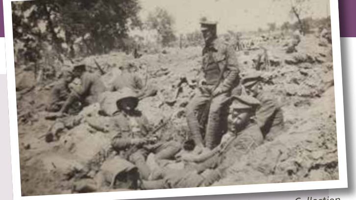
Shell holes at Cape Helles, 1915.

Gallipoli landing recreation , Port Collingwood, early afternoon, depending on tide.