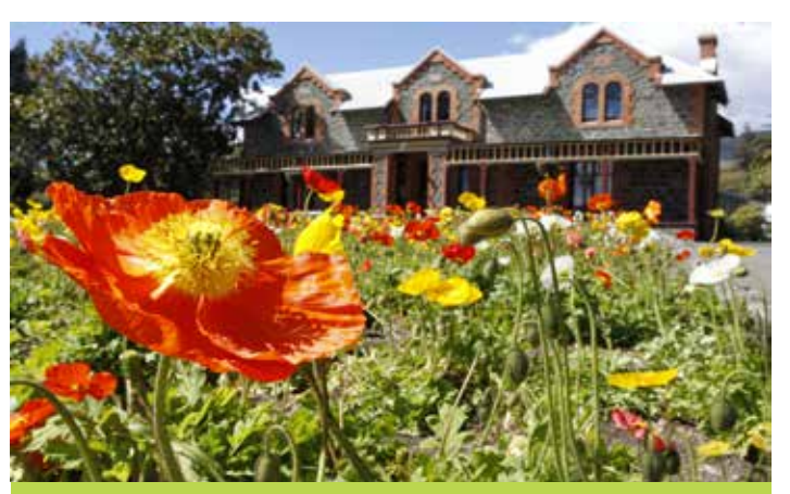
Poppies at Isel House

There promises to be something for everyone in the coming weeks of Anzac centennial commemorations. Check out the full programme at itson.co.nz