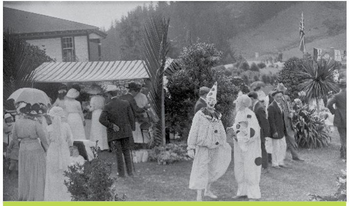
Red Cross Garden Party at the Boys Training Farm Stoke, Nelson, New Zealand, 18 December 1915.

One hundred years ago this month ANZAC troops landed on a beach at Gallipoli in Turkey; an illfated campaign widely regarded as contributing to New Zealand's nation building. A century on, the campaign is remembered during World War I centennial commemorations.