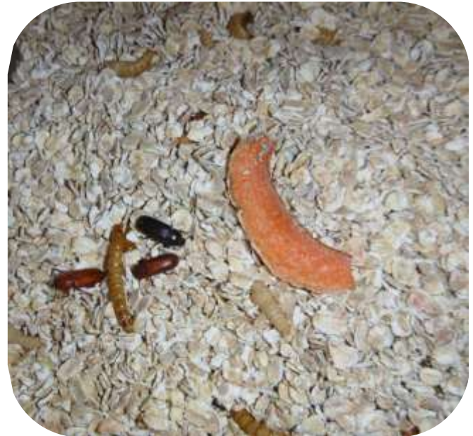
The light brown beetles above are our newest edition to the family.

We are really good now at breeding Mealie worms to feed the frogs and marking each of the worms' milestones, like when our newest editions to the Mealie worm family arrive. Two of our pupae have hatched into Darkling Beetles and enjoying having a swim in their water container. Then we know our Darkling Beetle Life cycle is complete and ready to start the cycle again.