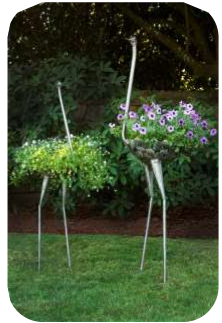
Planter box ideas – let your students get creative! Look at these beautiful birds.

Applications open: December 2016 – February 2017