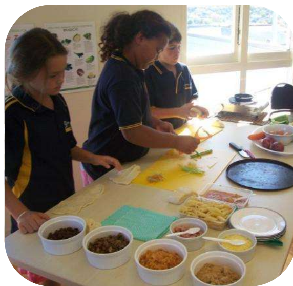
Cooking up some treats