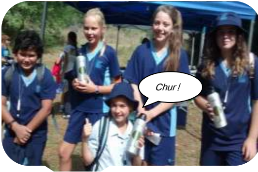
The winning team from Nelson Intermediate – congratulations!