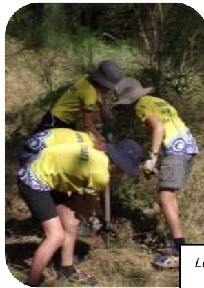
Lots of real team work!