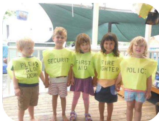
Campus Corner students show off their vests made from materials from the Artbox

An annual subscription of $15 applies; materials are free.