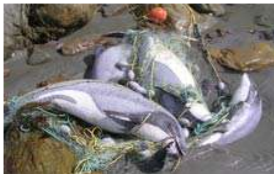
Four Hector's dolphins caught in a recreational set net

The Bank of Real Solutions http://realsolutions.org.nz/ is all about the Kiwi can-do attitude, "Out-thinking the problems because we can". It aims to capture the excitement and inspiration of working by creative determination to overcome that which challenges us.