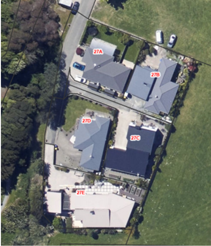
Table 3: Distances from activities to receiver locations