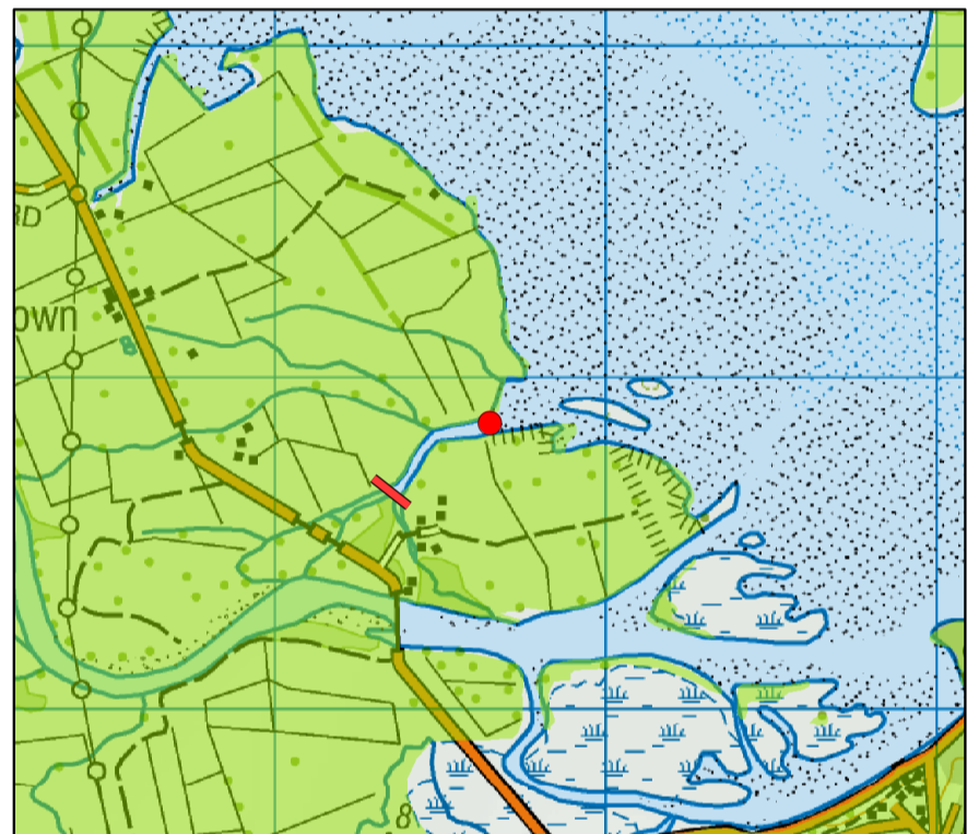
Aorere River (Northern Channel) Map 205