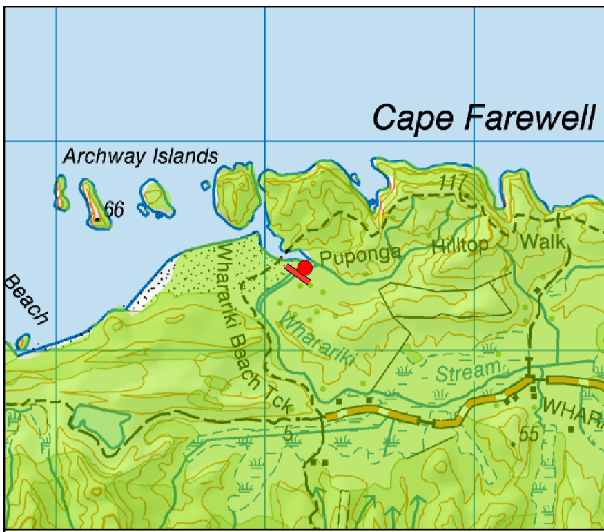
Wharariki Stream Map 202