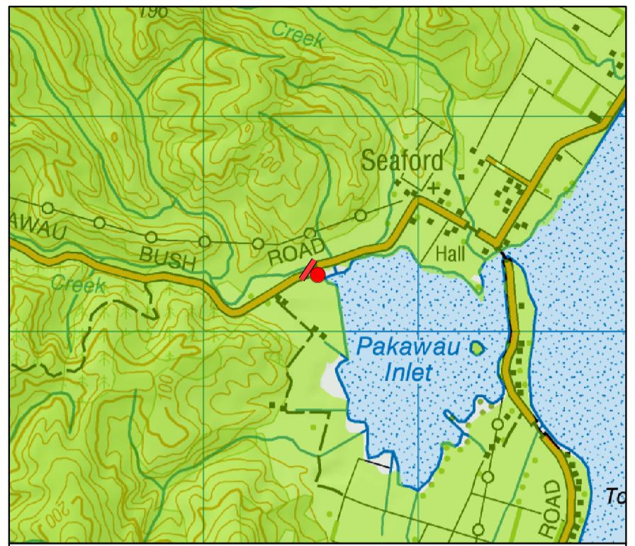
Pakawau Creek Map 203