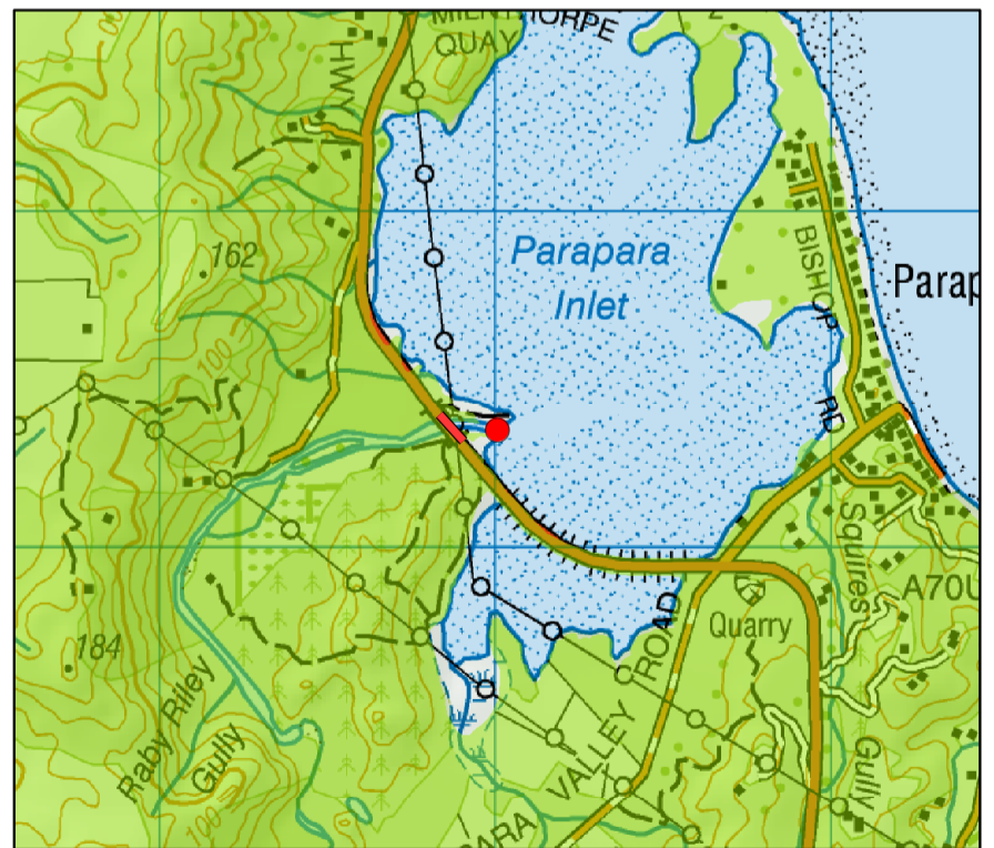
Parapara River Map 207