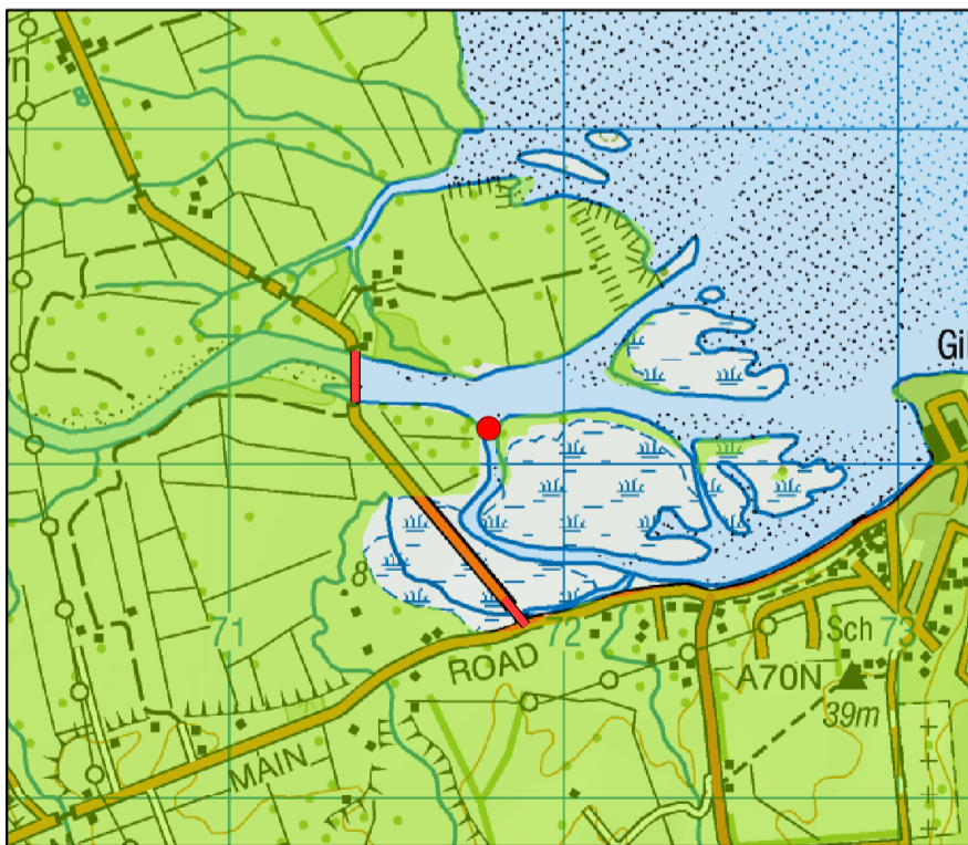
Aorere River Map 206