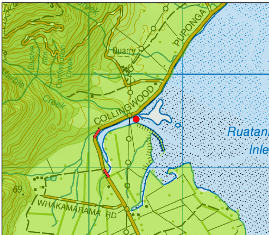
Gorge Creek Map 204