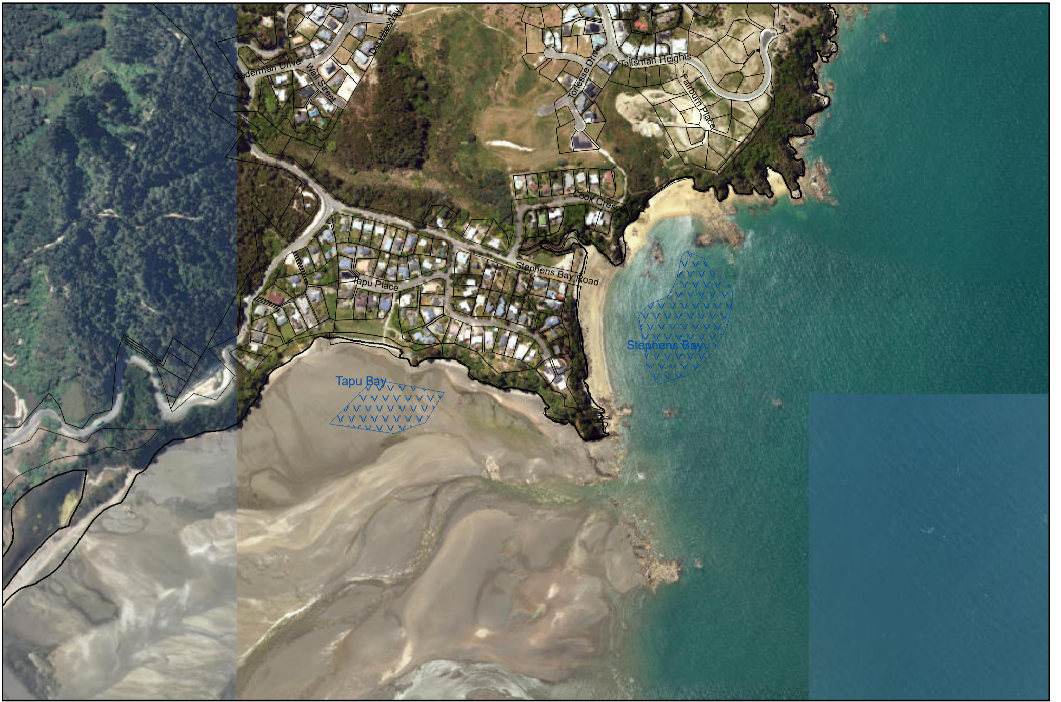
Map 180C: Tapu Bay - Stephens Bay