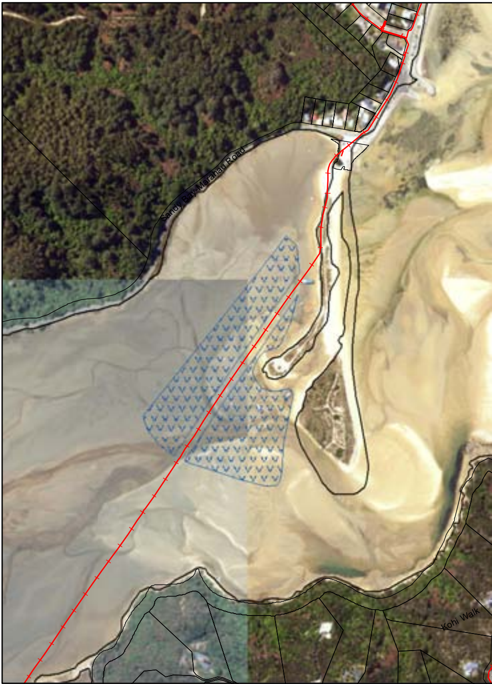
Map 180G: Otuwhero Inlet - Marahau