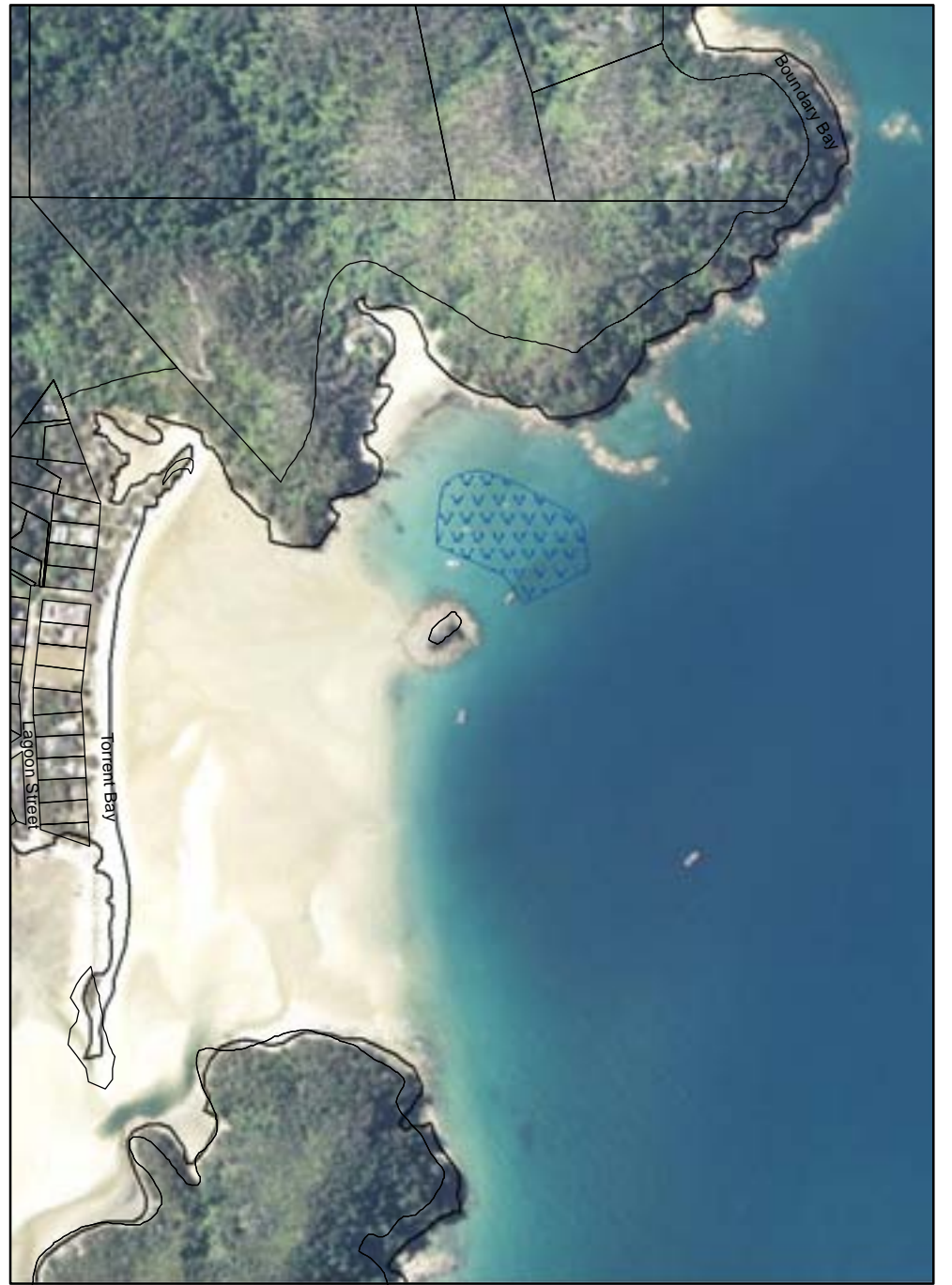
Map 180H: Glasgows and Torrent Bays