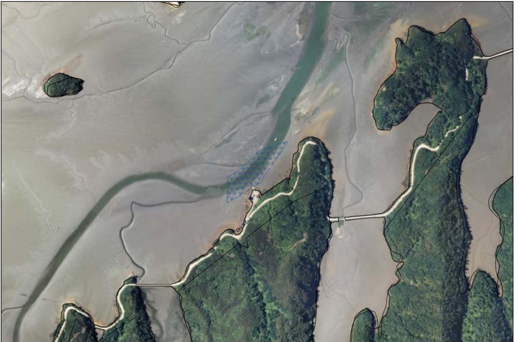
Map 180I: Mangarakau Wharf