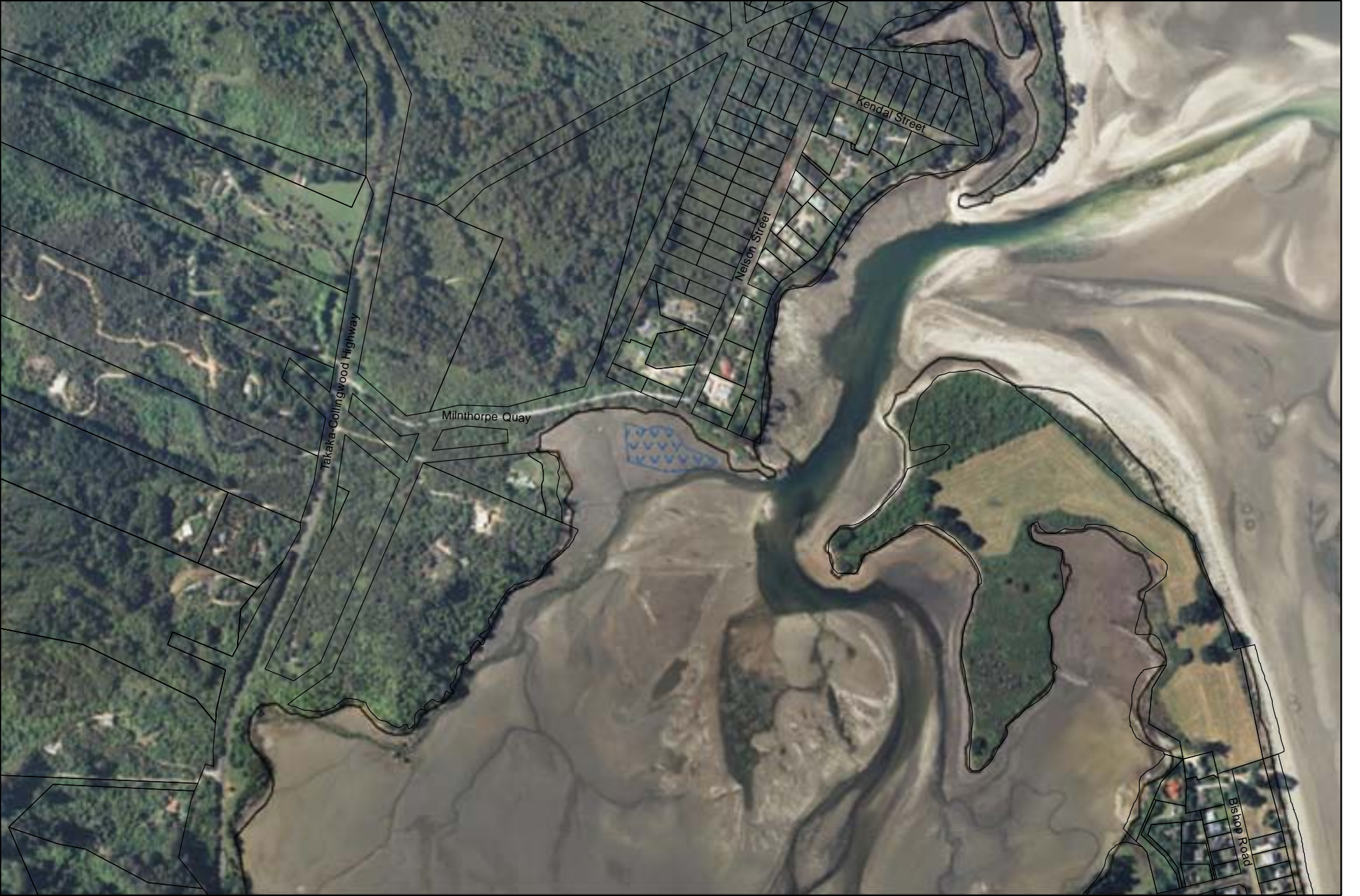
Map 180F: Milnthorpe