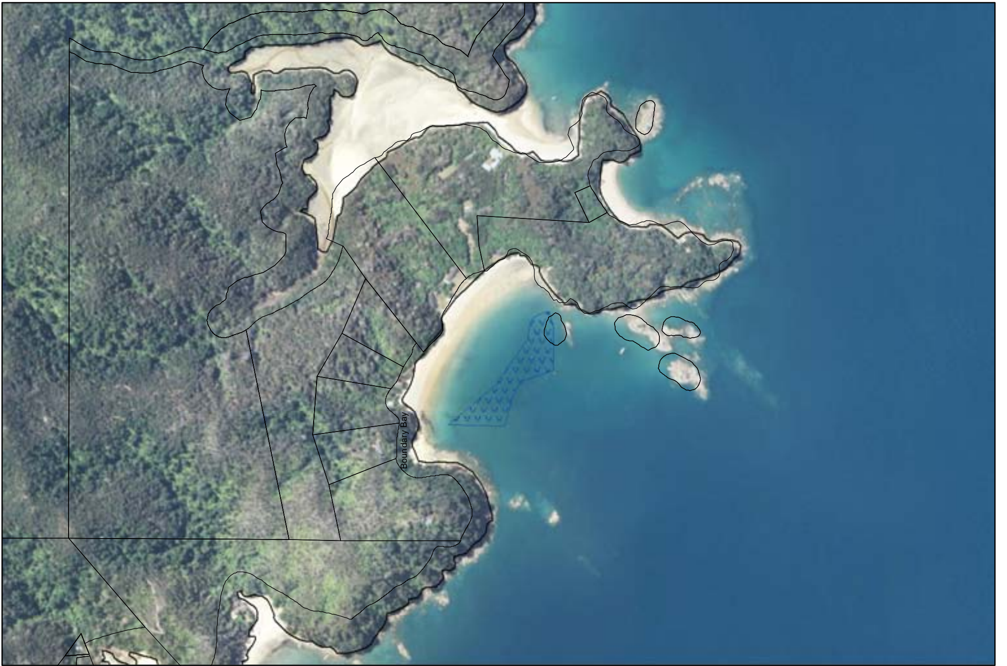
Map 180E: Boundary Bay