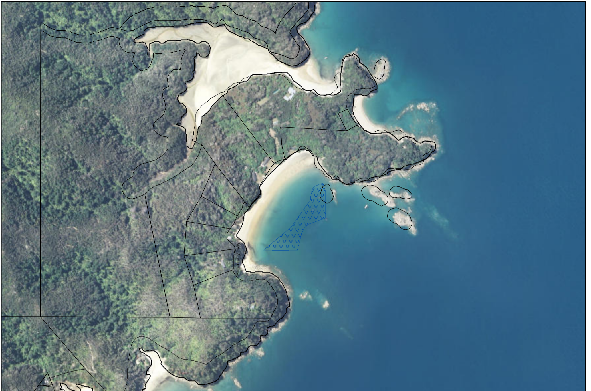
Map 180E: Boundary Bay