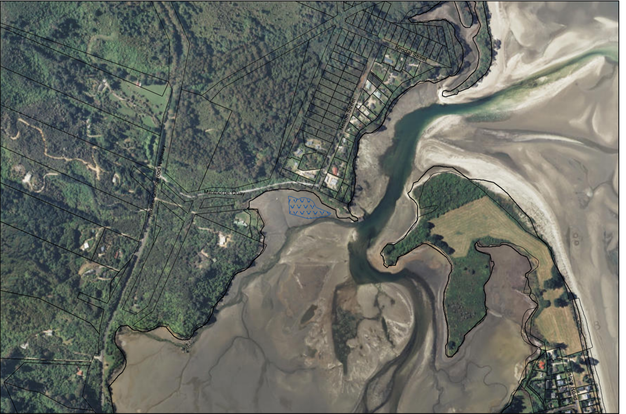
Map 180F: Milnthorpe