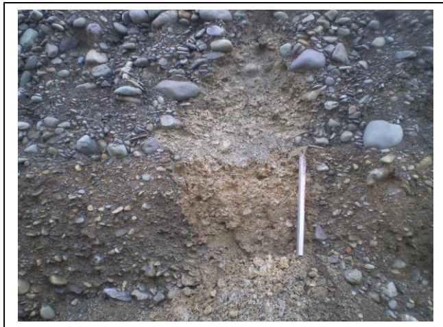
Figure 1. Brown clay-bound gravel overlain by pale brown weakly cohesive gravel.

Range to the east. The deposits, termed the Hope Gravel Formation (Johnston 1982), have older sediments at the base (circa 49,000 yrs) and in the lower layers comprises clay-bound gravel. A section of this material was observed in a gravel excavation pit on a property on River Terrace Road (Baigent property) where the exposure revealed several metres of dense brownish clay-bound basal gravels, overlain by pale brown, weakly clay enriched and less cohesive gravel (Fig 1).