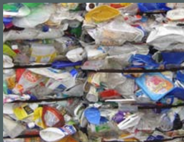
Plastic collected for recycling.