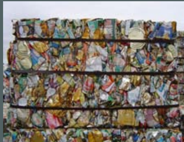
Cans collected for recycling.

Under this legislation Council is required to carry out a waste assessment and to prepare a Waste Management and Minimisation Plan (WMMP) by 2012. This WMMP will supersede the existing Waste Management Plan.