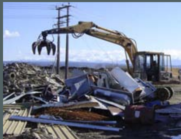
Car crusher at work.