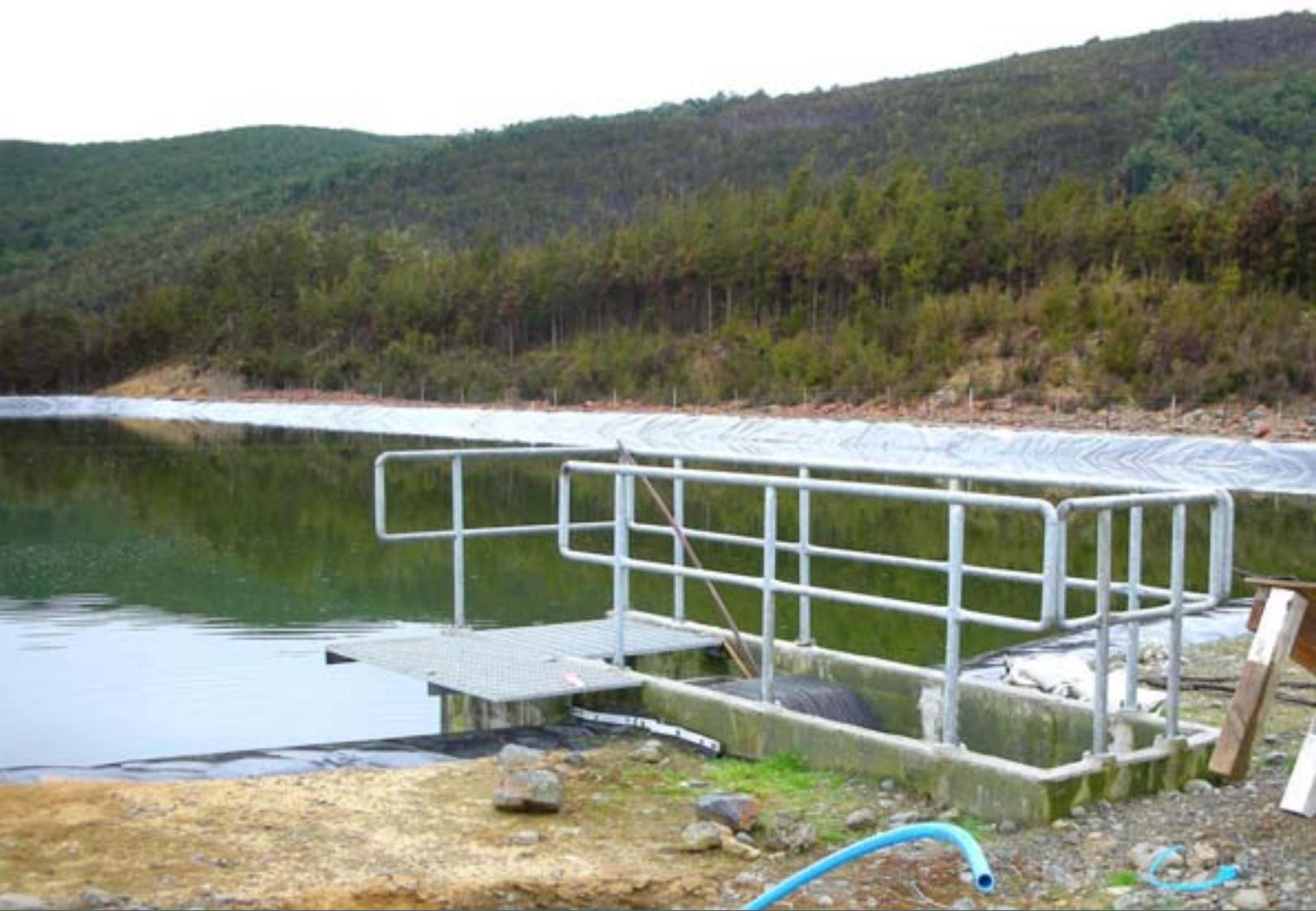
St Arnaud wastewater treatment plant.