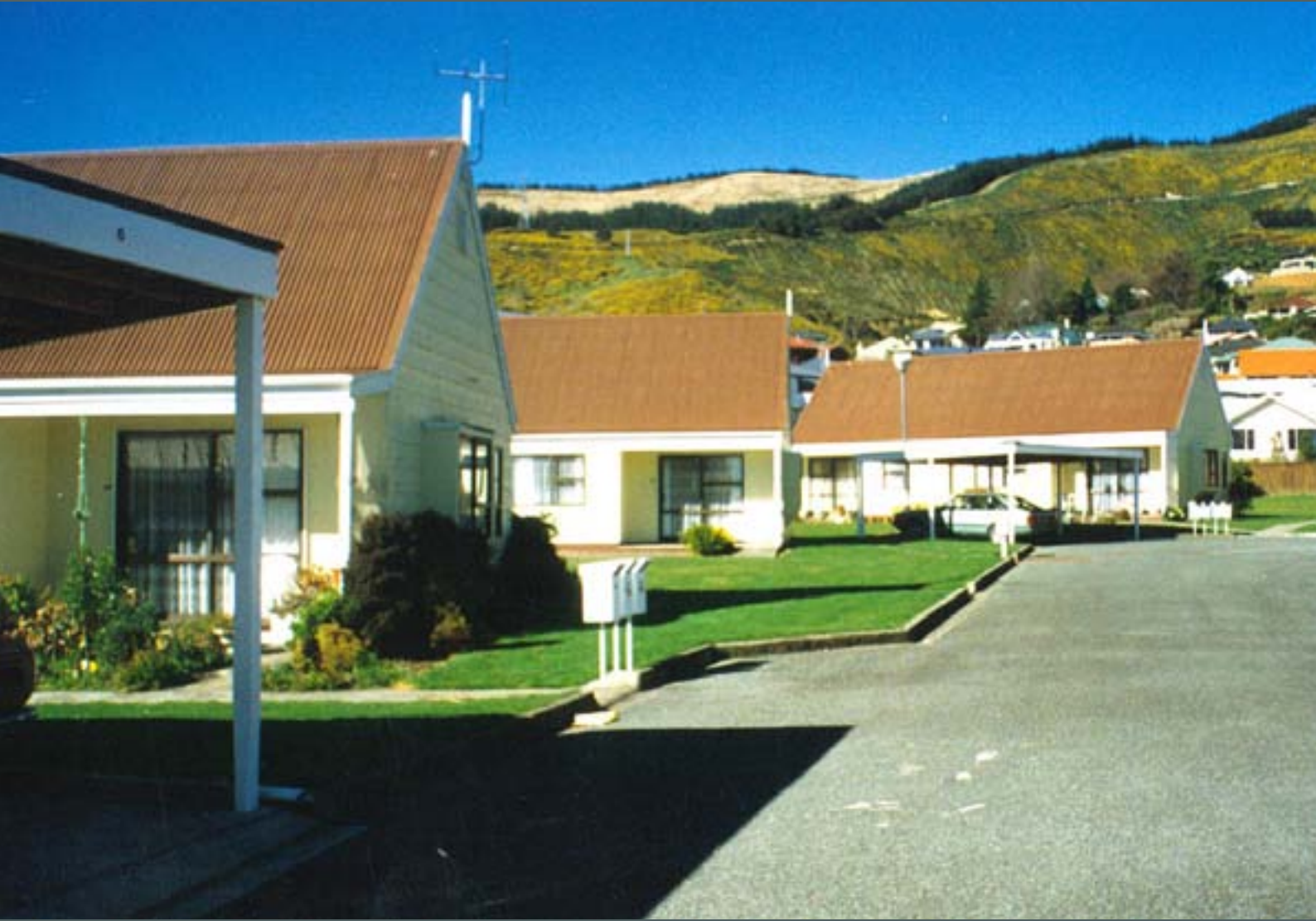
Council owned Community Housing in Richmond