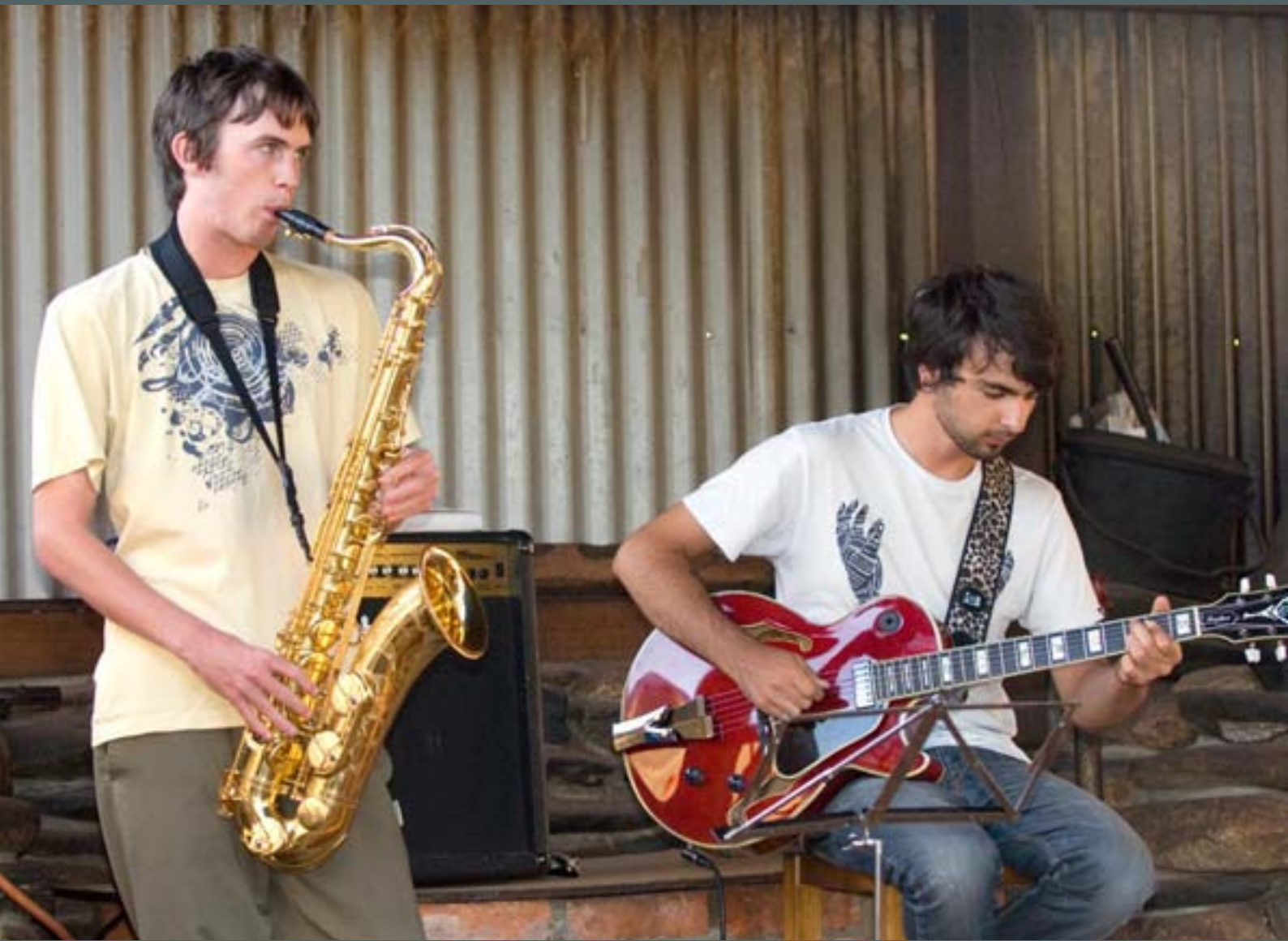
Musical event at the Naked Possum Cafe