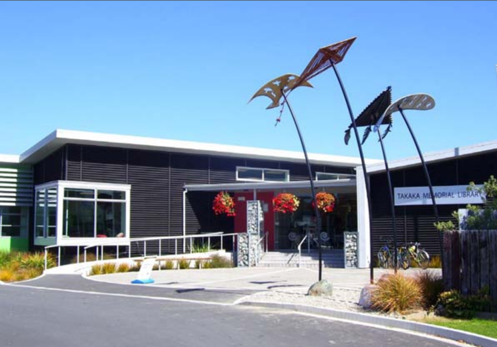
Takaka Memorial Library