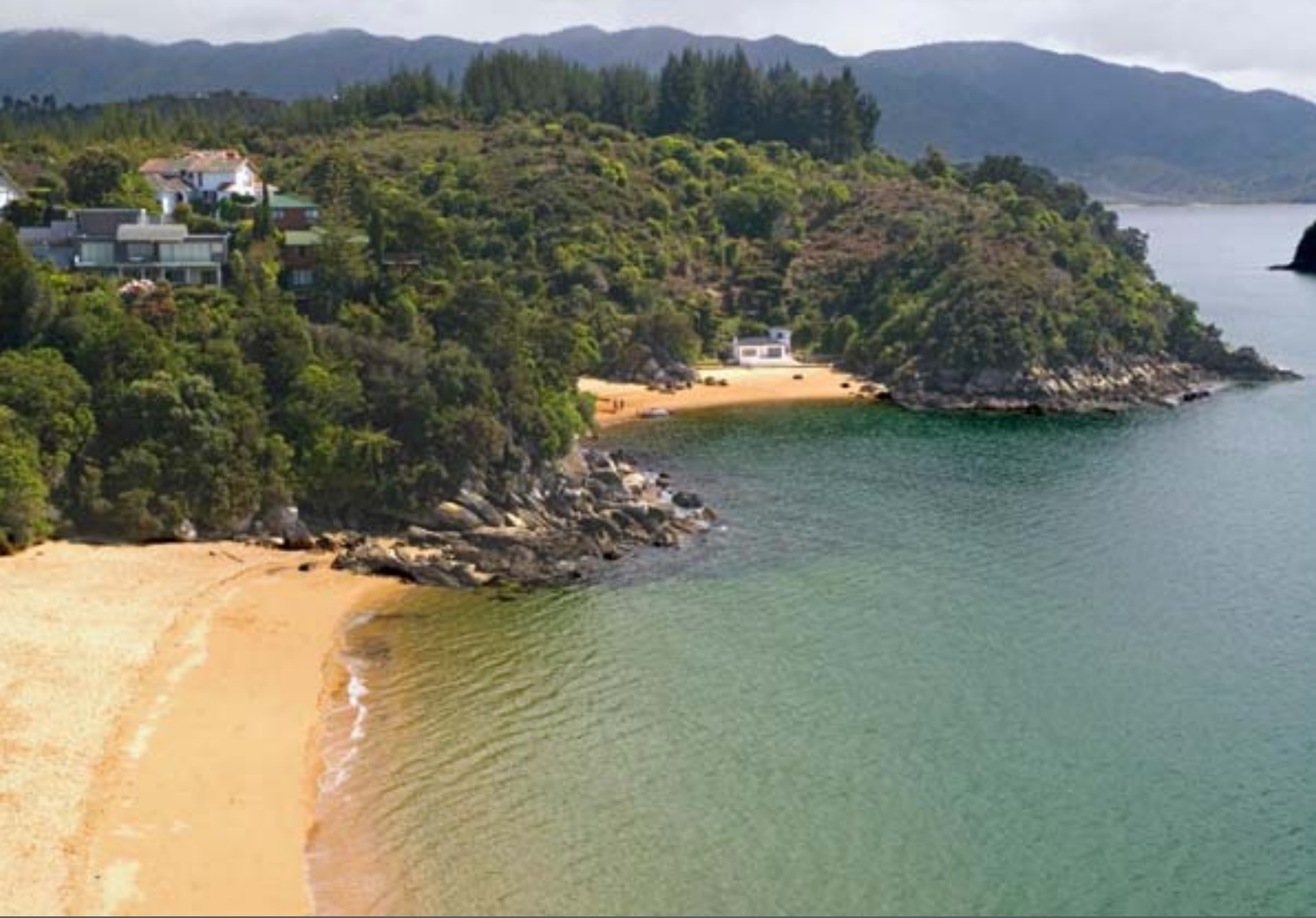
Breaker Bay, Kaiteriteri