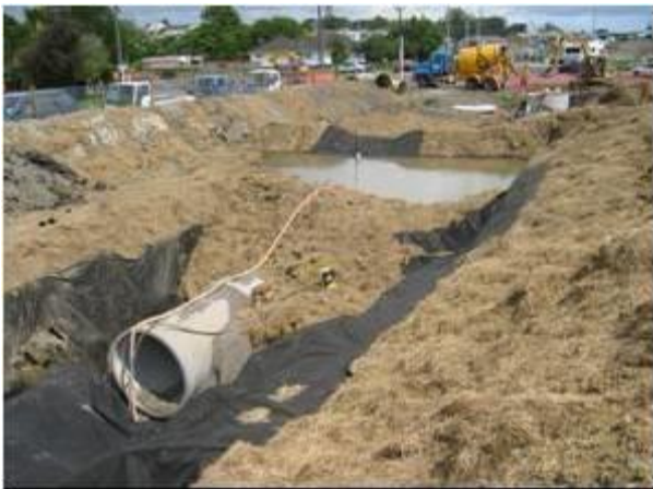
Figure 12-1 Pipe installation being dewatered to decanting earth bund

Unless correctly planned and managed, the installation of services and utilities such as electricity, gas, water, sewer and telecommunications can result in significant disturbance to the ground surface. Soil erosion and sedimentation are common environmental impacts of trenching and dewatering of trenches.