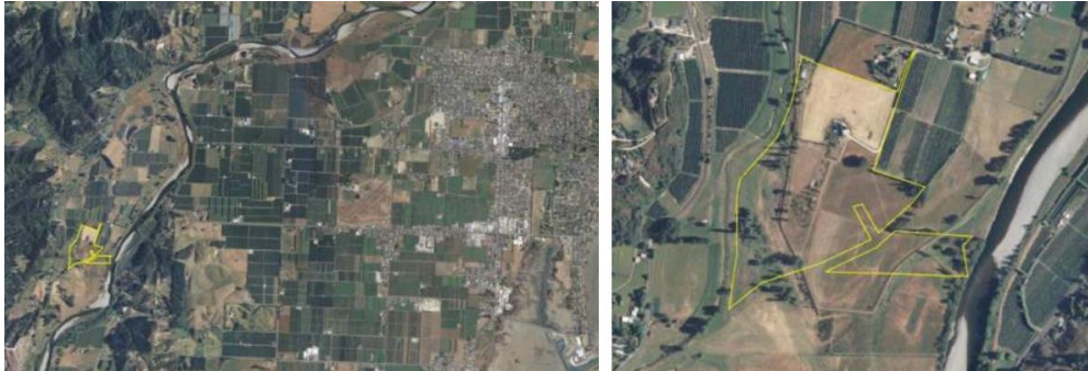
Figure 1: Location and boundary of the proposed gravel extraction site

Hours of operation will be limited to 7.30 am to 5 pm Monday to Friday , with no work during weekends or on public holidays.