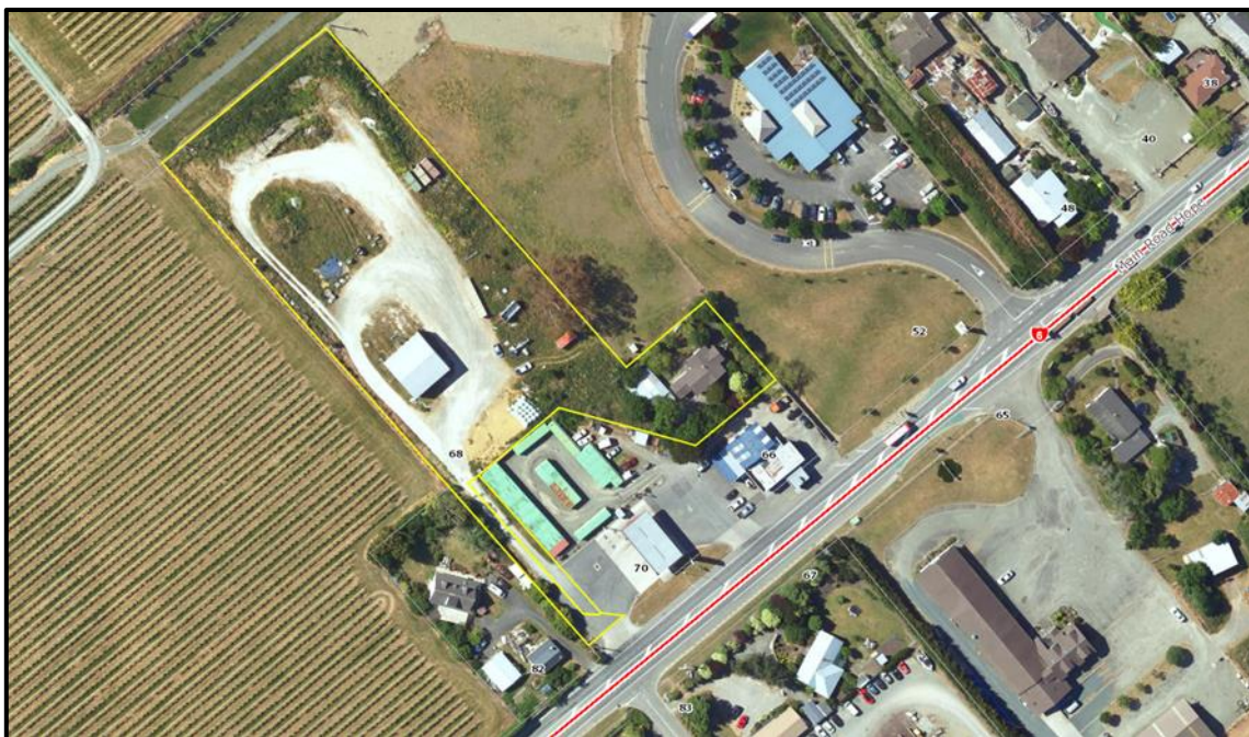
Figure 4: Plan Change Request Site Location

Figure 4 shows the land sought to be included in Schedule 17.5 of the TRMP.