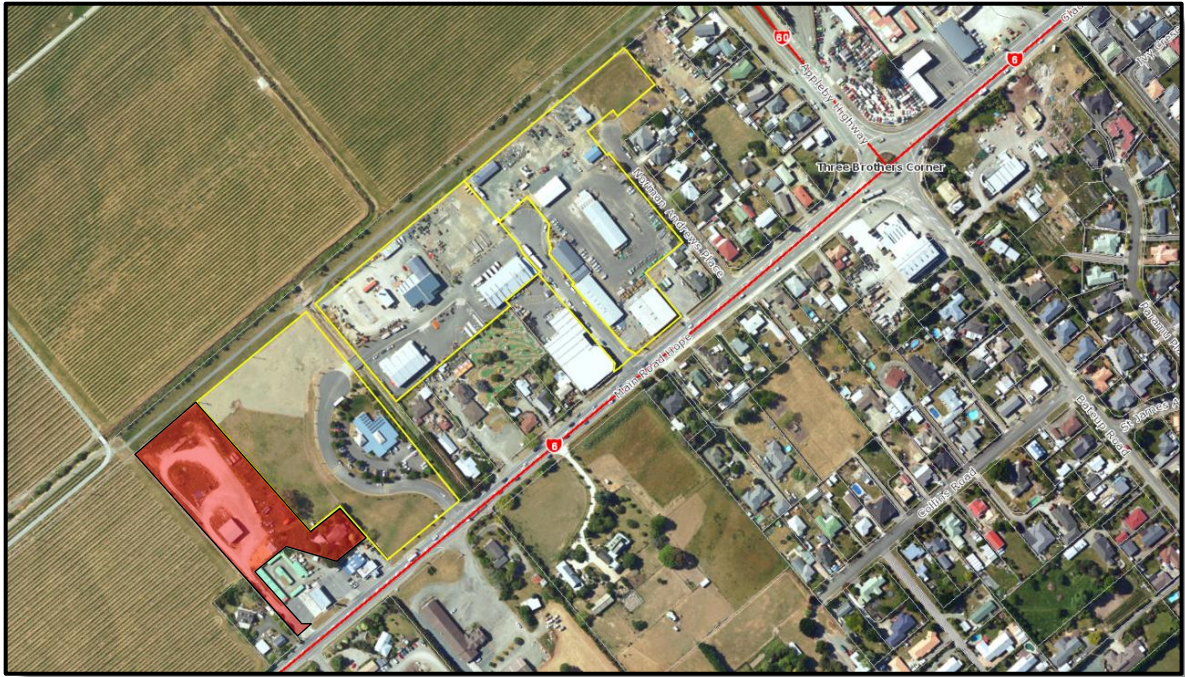
Figure 10: Network Tasman land subject to PC50: (Source: Top of the South Maps)

The area of land covered under Plan Change 50 owned by Network Tasman is shown in the areas within yellow lines (which formed part of the previous plan change request). The plan change request area is shown by red shading.