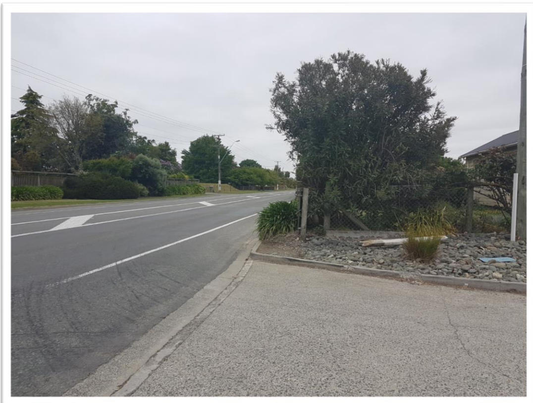
Figure 7: Sight Distances to the South

Figure 7 shows the sight distance to the south for vehicles exiting the existing access.