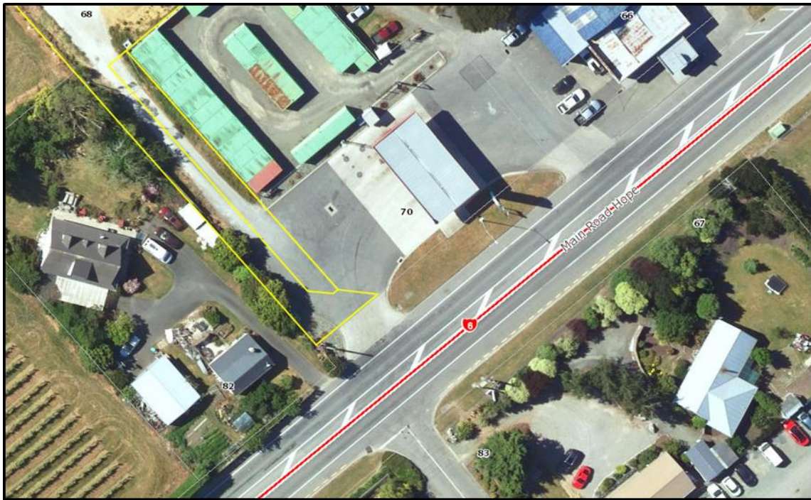
Figure 5: Existing Site Access

Figure 5 shows the current access arrangements into the existing site.