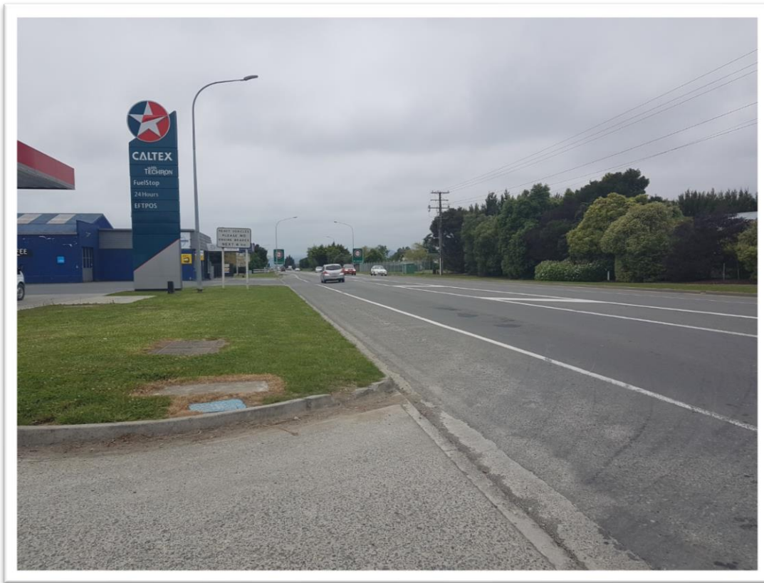
Figure 8: Sight Distances to the North

Figure 8 shows the site distance to the north for vehicles exiting the site.