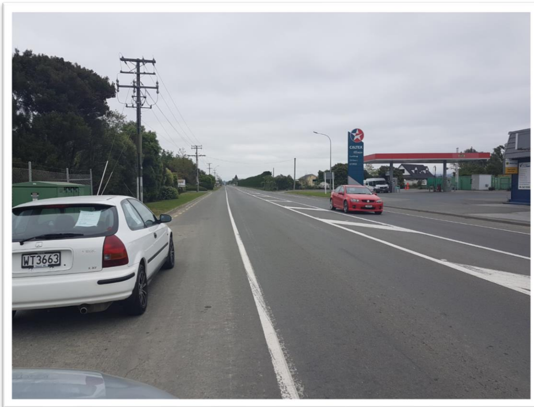
Figure 2: Road Environment

Figure 2 shows the road environment immediately outside the site.