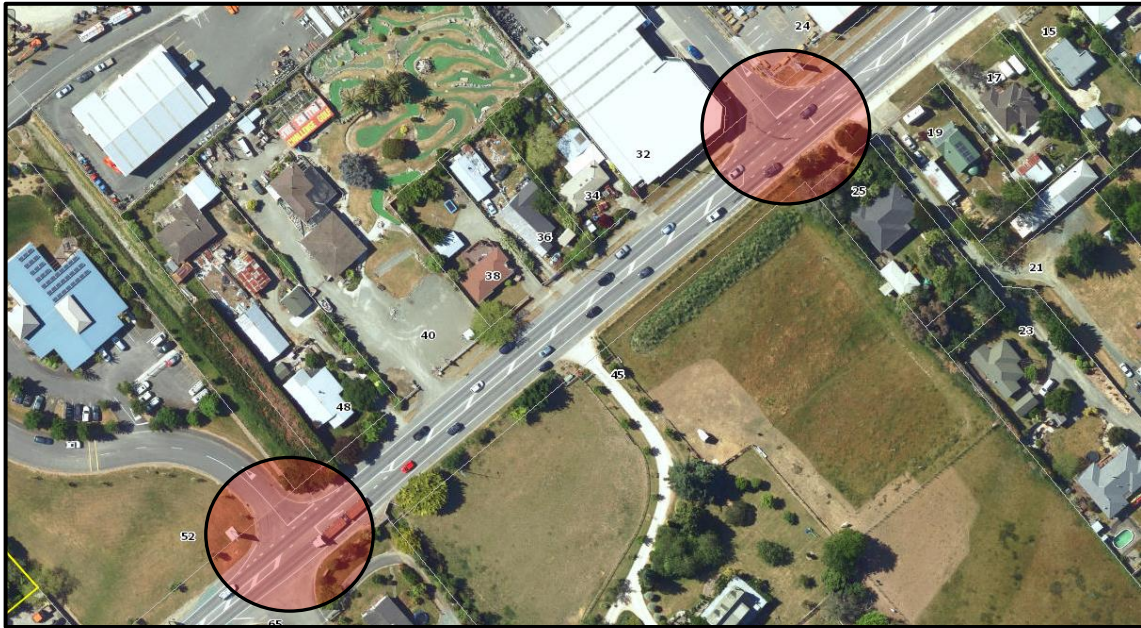
Figure 9: Schedule 17.5 Land access points.

As shown, the two access points are well designed with both accesses formed to a typical intersection standard. Both accesses are controlled by give way signs with State Highway 6 traffic having priority of the side access roads. There is a flush median that provides right turn bays for turning traffic to wait safely in the middle of the road and not obstruct through traffic on the highway.