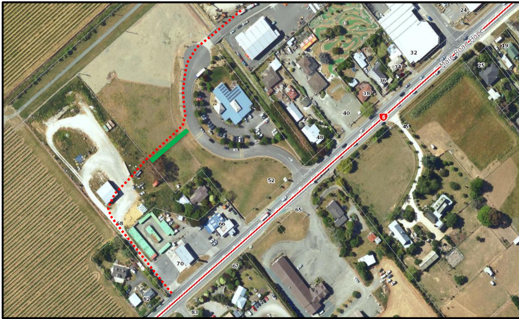
Figure 11: Indicative access road and service vehicle tracking

The proposed access for the long servicing vehicles will see the driver enter via the existing southern crossing to 68 Main Road Hope and then travel along the existing access. The goods will be loaded and unloaded on the site and then the truck would proceed on the existing roading associated with Plan Change 50 and exit onto the highway via Norma Andrews Place.