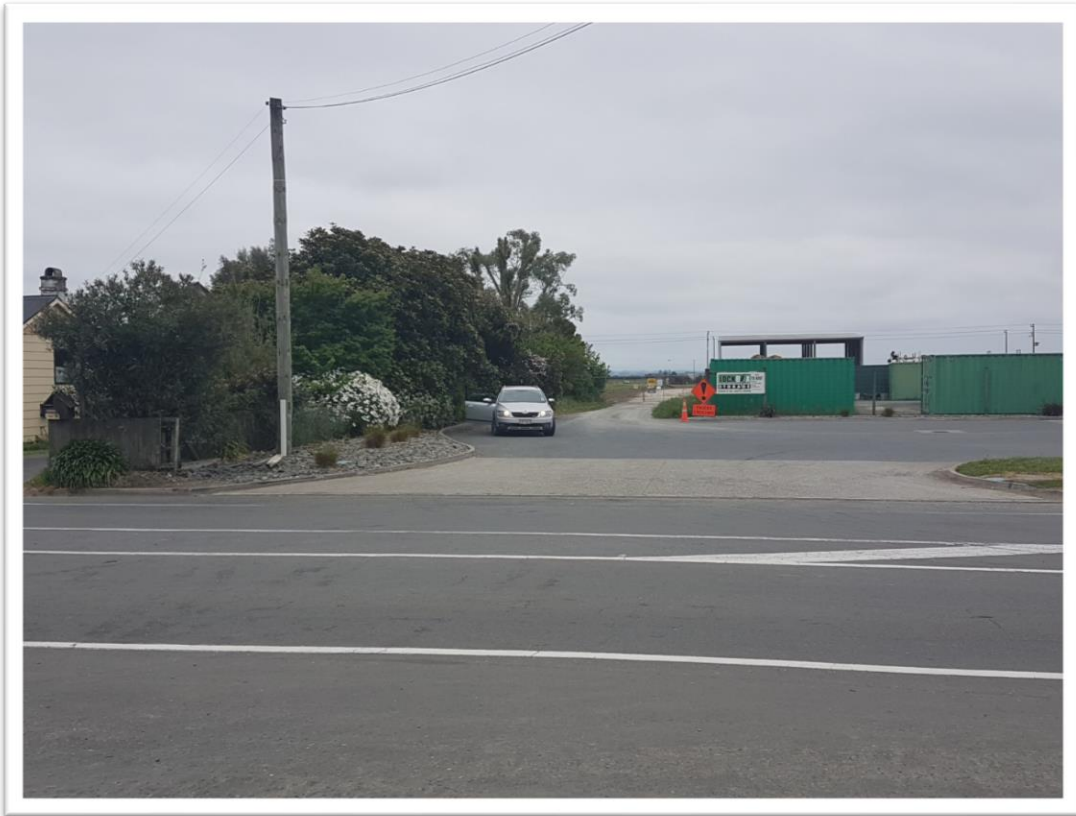
Figure 6: Existing Site Access

As shown the existing crossing is wide to provide for the turning requirements for trucks that use the service station and the existing site. There have been no reported issues with trucks using this to gain access to the land that forms the plan change area.